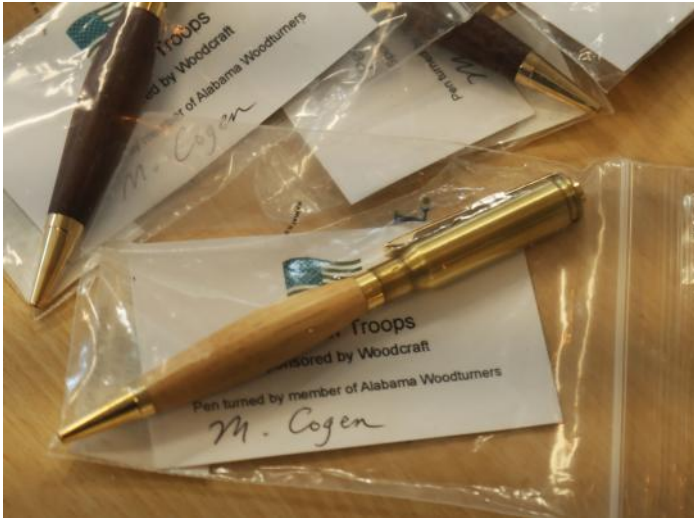
MARTY COGEN Turn for Troops