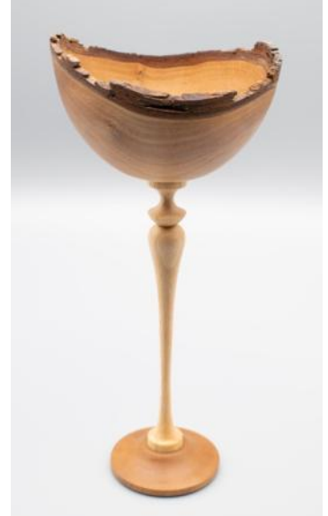
Three part natural edge goblet