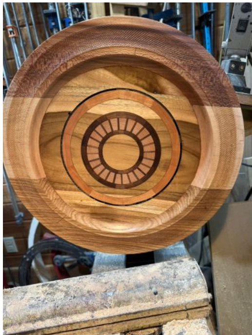
RANDY TYNER 15" platter with textured edges