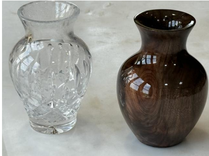
RANDY TYNER Walnut Vase