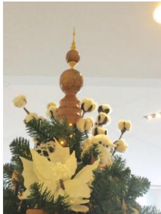
2019 AWA Tree Topper