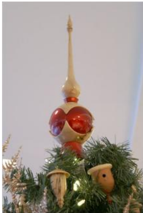
2015 AWA Tree Topper

Note: We need a volunteer to make the 2026 tree topper!