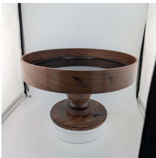
LEE FERGUSON Black Walnut Serving Stand