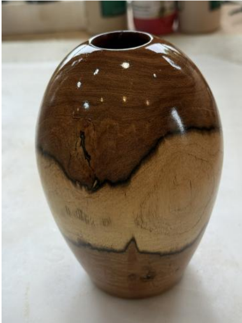
RANDY TYNER Unknown wood