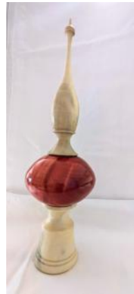
2022 AWA Tree Topper