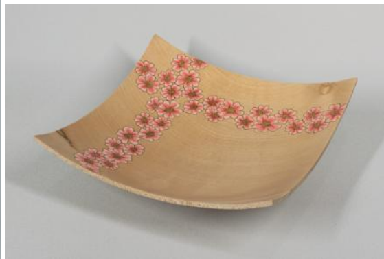
Square platter with embellishing techniques