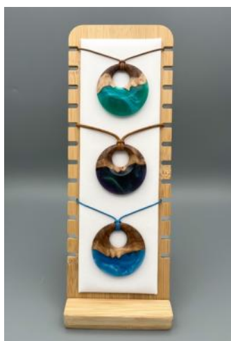
Pendant turning in resin and burl

Three sided box with texture and color This demo will cover turning on different axis to create a three sided box, texturing using burrs and dry brushing to color.