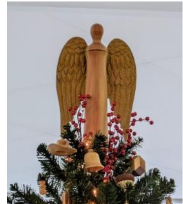
2024 AWA Tree Topper