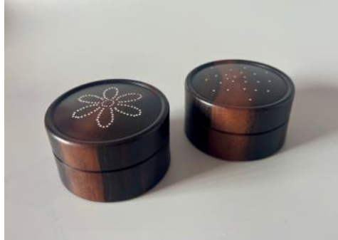
Trinket box with silver embellishing techniques