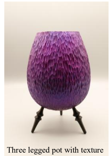
Three legged pot with texture