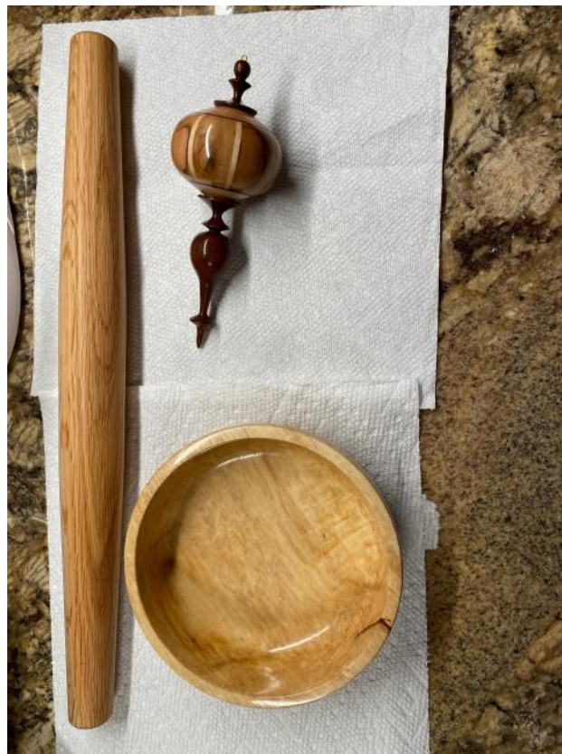
DWIGHT HOSTETTER White oak French Rolling Pin Japanese Maple bowl Segmented Ornament - Dogwood, Walnut, Maple