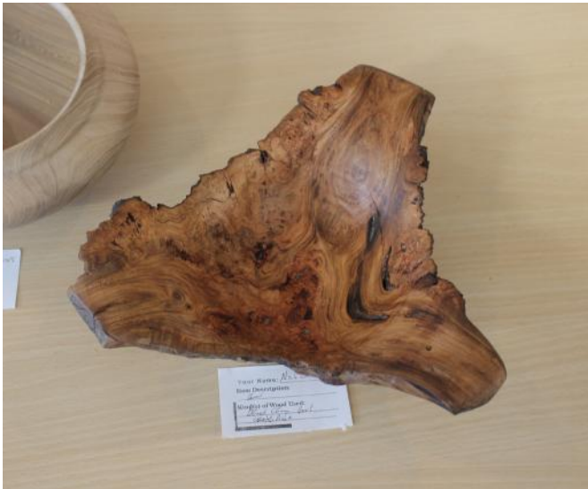
NOAH LOHAN Black Cherry bowl