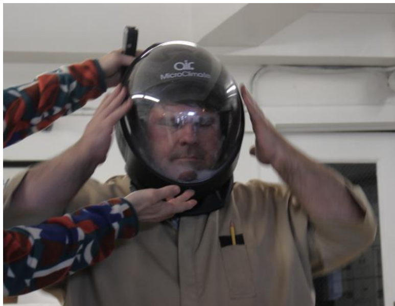
Air Micro Climate face shield given to the club for demonstrations