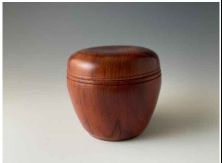
CARL CUMMINS Redheart box 3"x3"