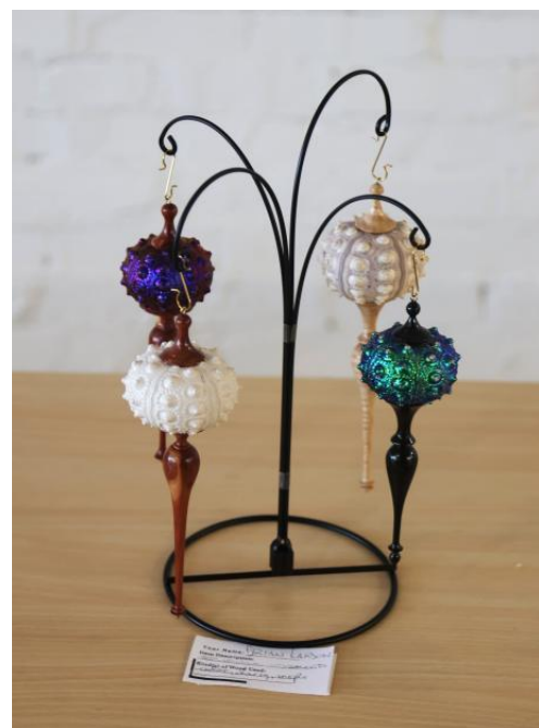
BRIAN LARSON Sea urchin ornaments