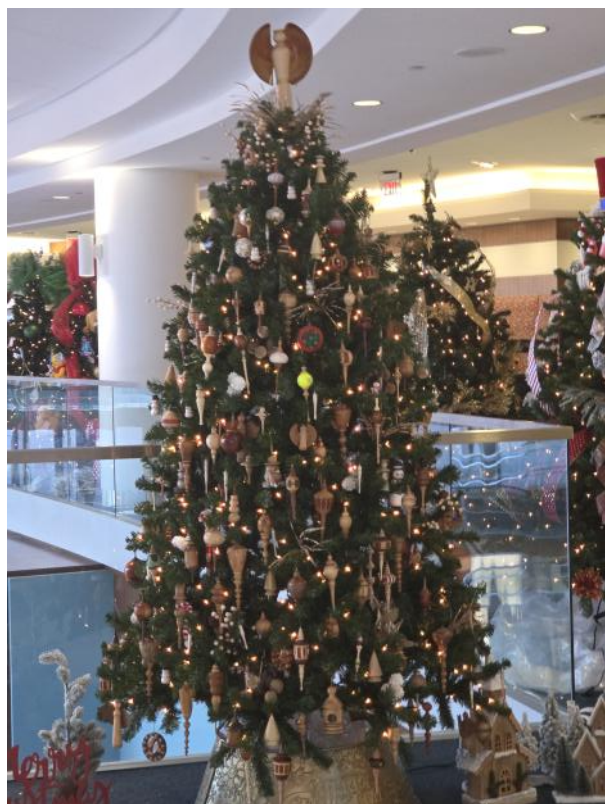
2025 Tree at Children's Hospital of Alabama

Collecting turned Christmas Ornaments now! Don't forget to bring your turned ornaments to the meeting.