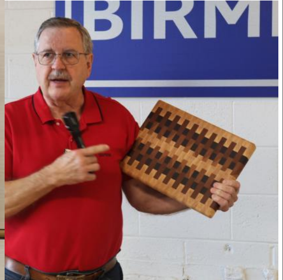
DWIGHT HOSTETTER Cherry, Hickory, and Walnut end grain cutting board