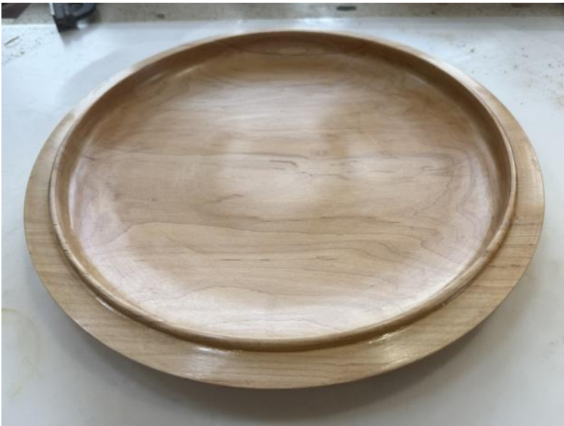
RANDY TYNER Large 12in maple platter