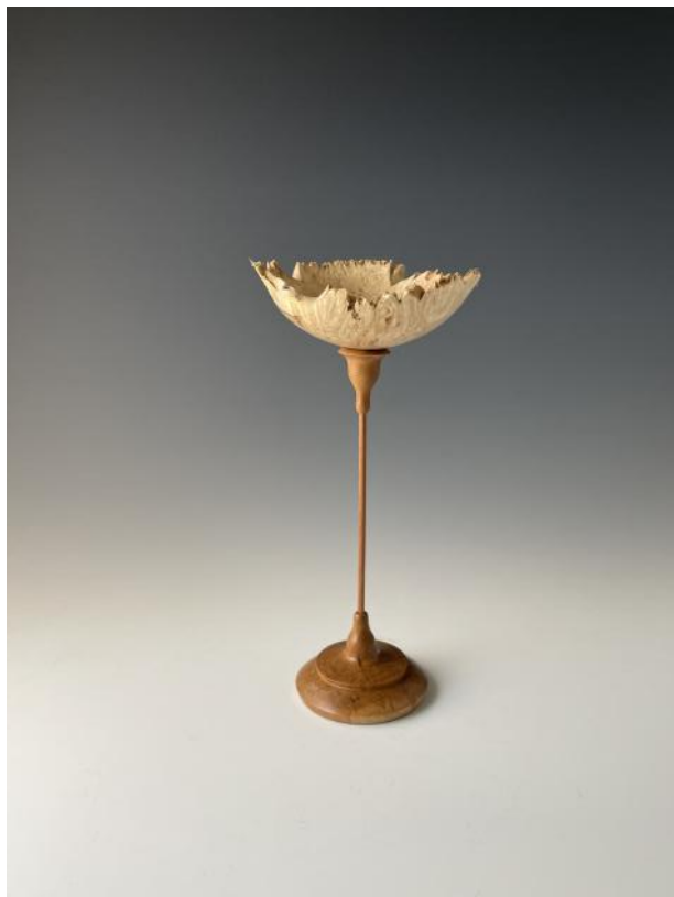
CARL CUMMINS Maple Burl and Cherry 7" x 3-1/2"