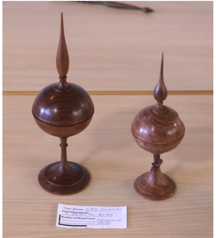
CARL CUMMINS Pedestal boxes, Sapele and Mesquite