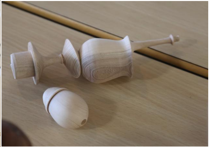
CARL CUMMINS First attempt