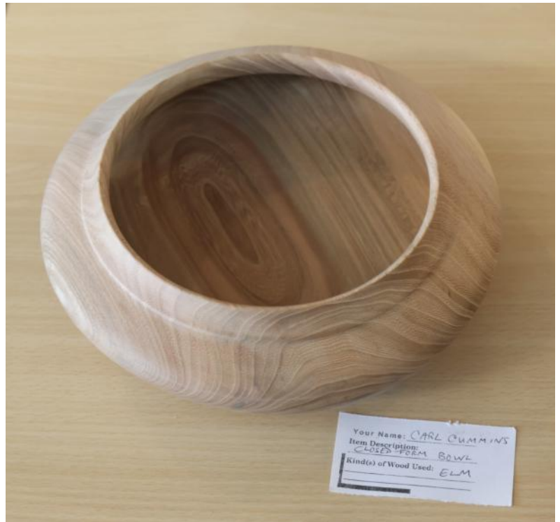
CARL CUMMINS Closed form bowl, Elm