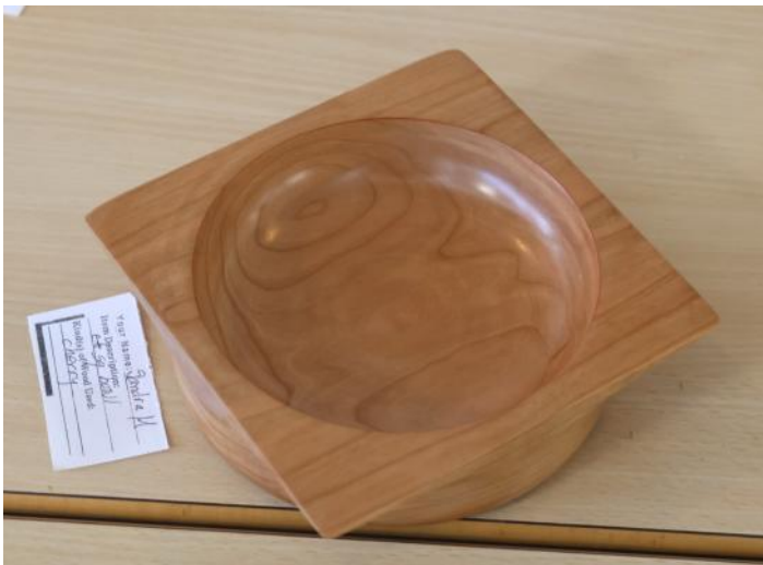
SANDRA MCMILLAN Square bowl, cherry