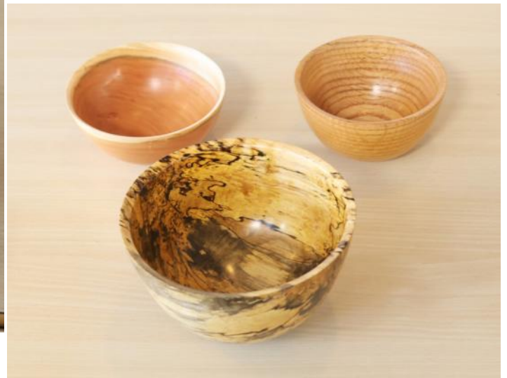
ROCKY KIMBLE Spalted maple, red Oak, and black cherry