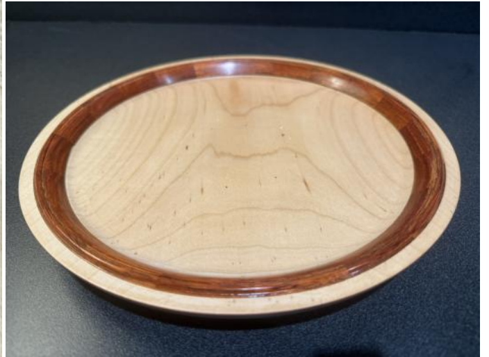
RANDY TYNER Maple with a segmented padauk ring inserted then turned into a platter