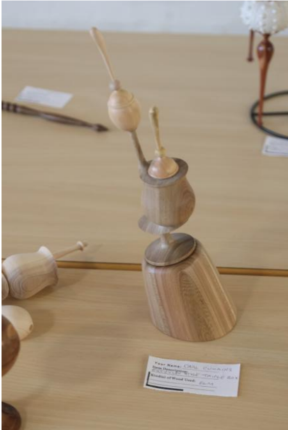
CARL CUMMINS Escoulen style triple box , Elm