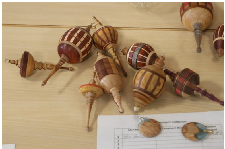
ORNAMENTS COLLECTED FOR FEBRUARY

RIDDLE Why are Christmas trees bad at knitting?