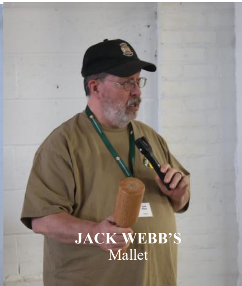
JACK WEBB'S Mallet