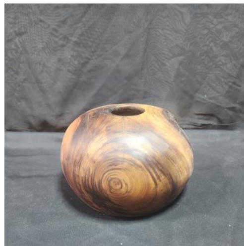
Koa Hollow Form