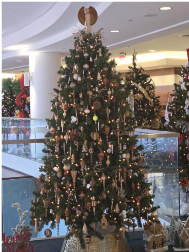
2025 Tree at Children's Hospital of Alabama

Collecting turned Christmas Ornaments now! Don't forget to bring your turned ornaments to the meeting.