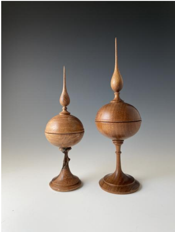
CARL CUMMINS 7.5"x2.5" Mesquite; 9"x3" Sapele