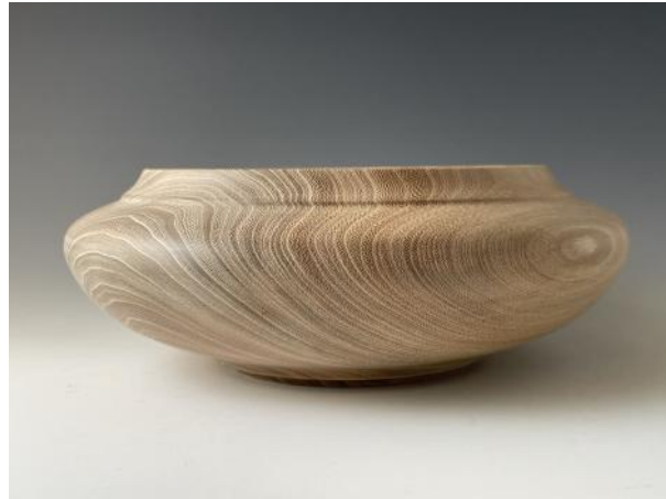
CARL CUMMINS 8.5"x3" Elm