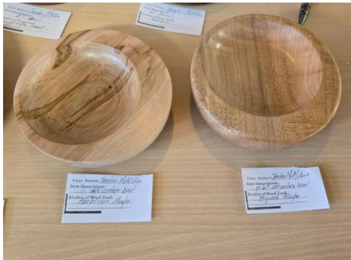
SANDRA MCMILLAN Off-center bowls