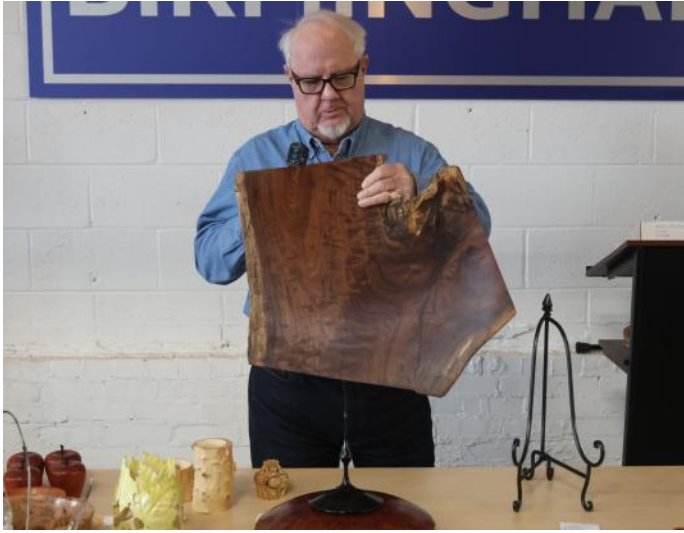
HOWARD KING Large Bowl