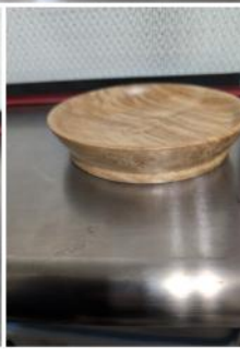
These are the pieces sold at Pepper Place.