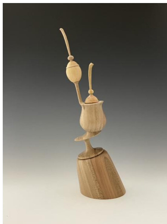
CARL CUMMINS 11"x4.5"x3" Elm