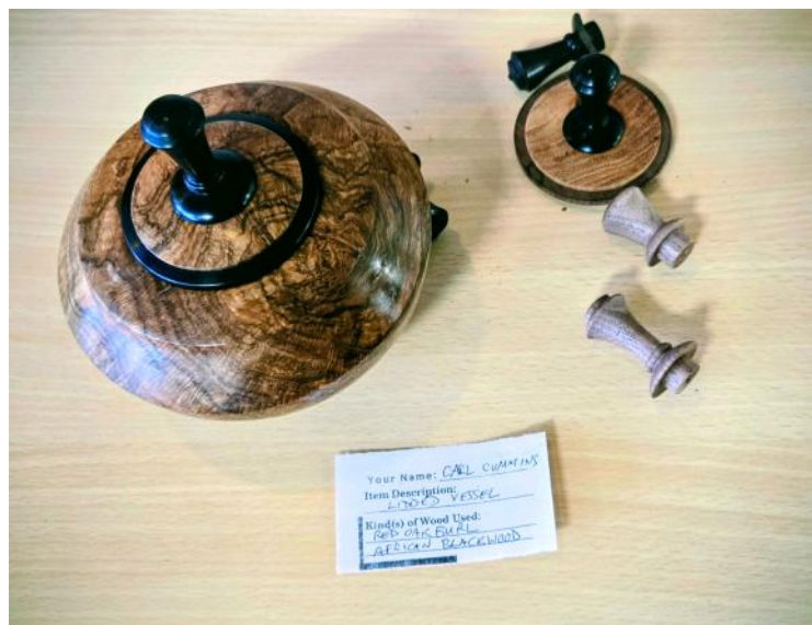
CARL CUMMINS Lidded vessels