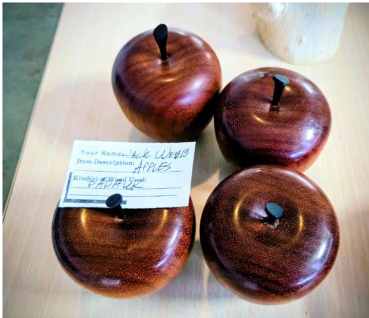
JACK WEBB 'Not Rotten' Apples