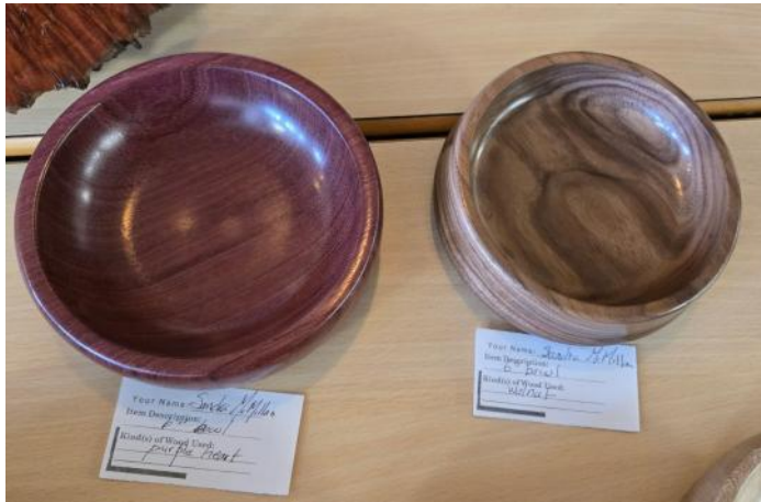
SANDRA MCMILLAN Purple Heart Bowl & Walnut Bowl