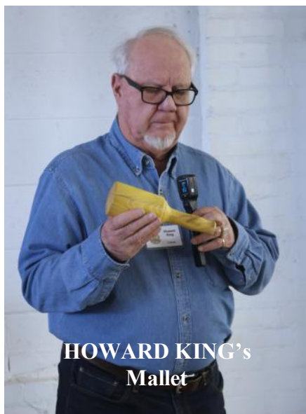
HOWARD KING'S Mallet