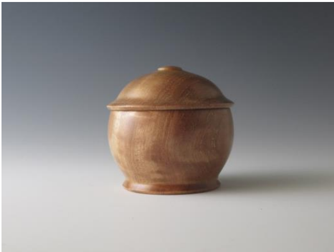
CARL CUMMINS Box - Curly Pynma