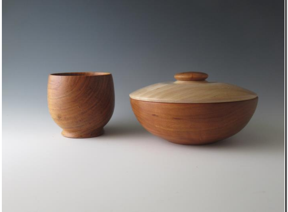
CARL CUMMINS Bowls - Cherry with Curly Maple