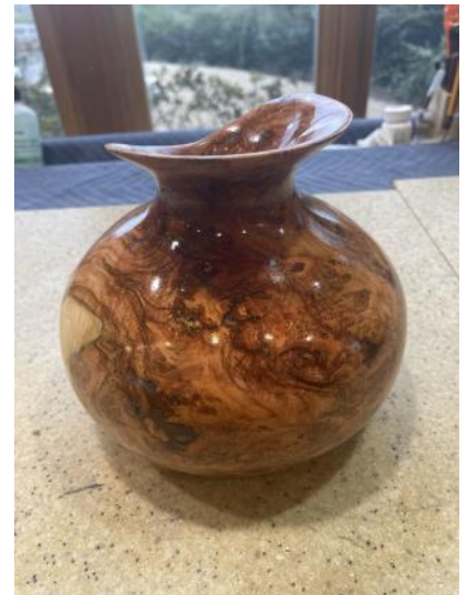
RANDY TYNER Osage Orange vase with sealer, friction polish, and lacquer