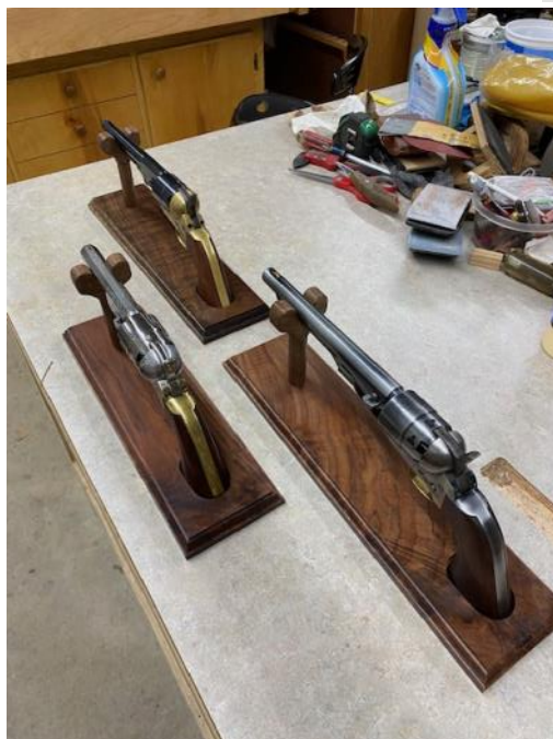
DWIGHT HOSTETTER Gun mounts for 3 replica antique ball and cap pistols