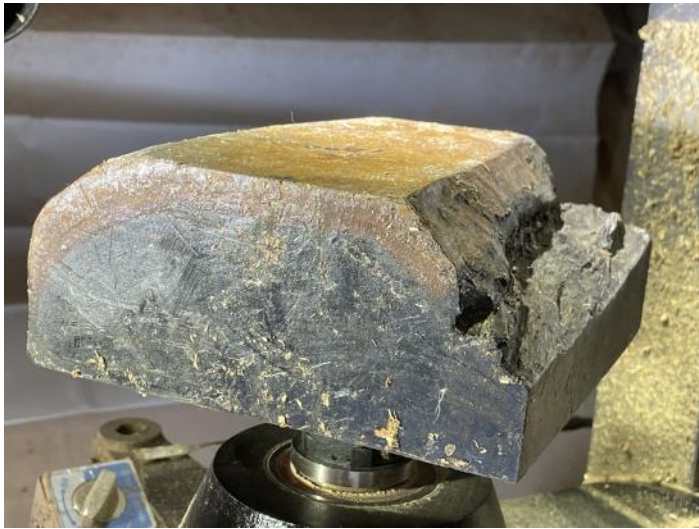
View 1 Original piece of wood