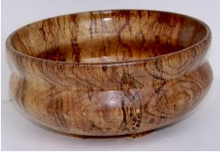
MAURICE CLABAUGH #12406 CHSYALIS? SPALTED PECAN 11" W X 5"H