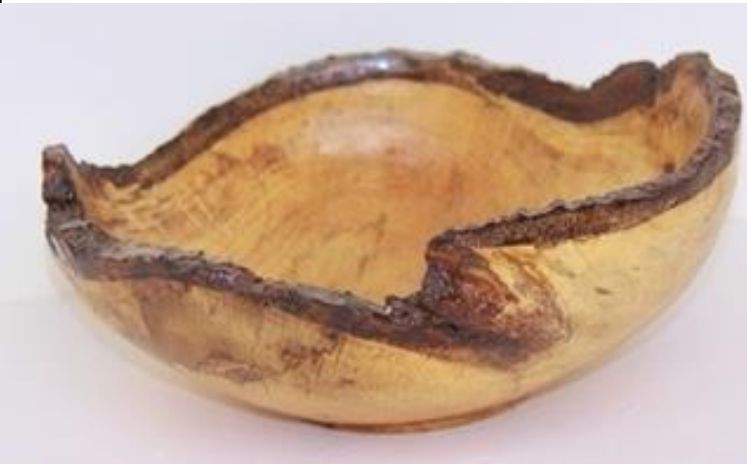
MAURICE CLABAUGH #12405 FREEFORM EDGE SPALTED WHITE