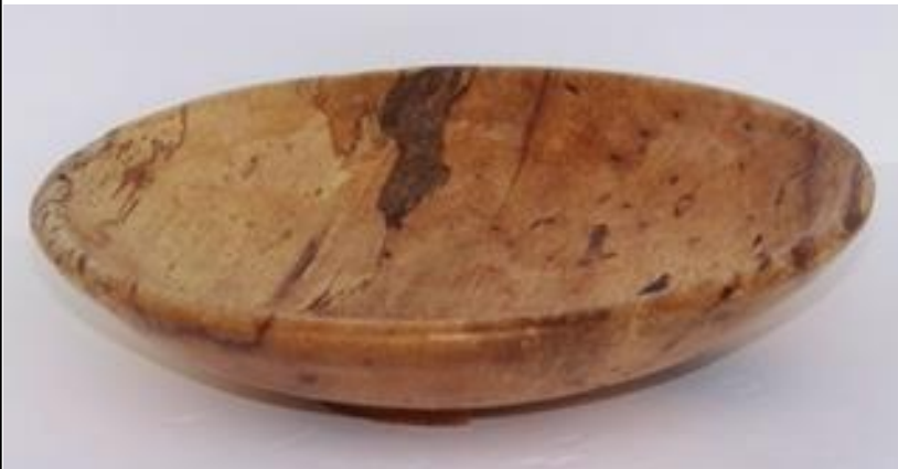
MAURICE CLABAUGH #12402 BROWN SPOTS