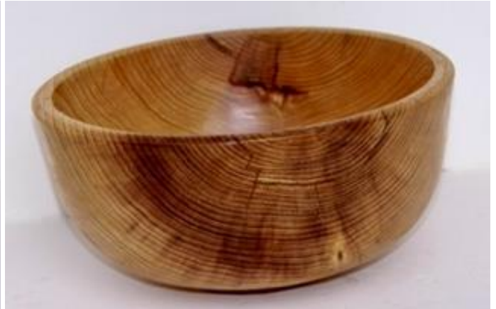
MAURICE CLABAUGH #12486 FIGURE CYPRESS 11" W X 5.5" H