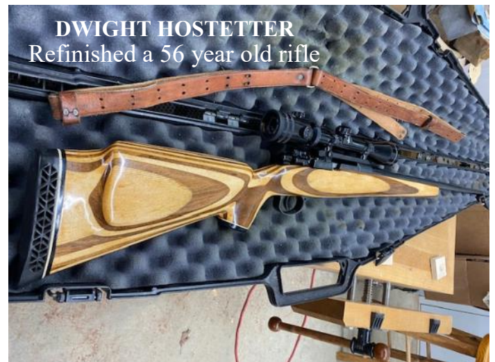
DWIGHT HOSTETTER Refinished a 56 year old rifle