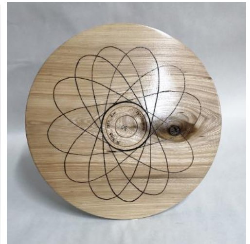
HOWARD KING Wall Hanging made of Elm