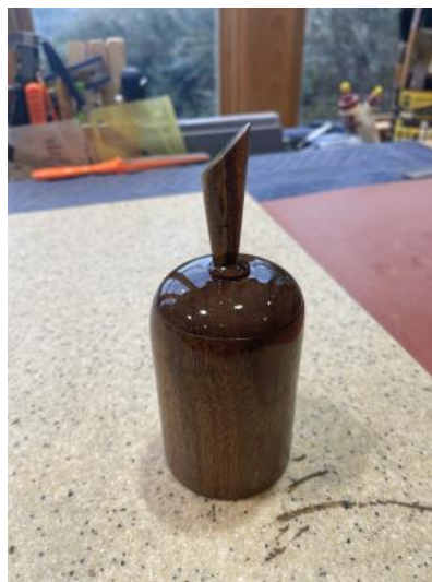
RANDY TYNER Threaded walnut box