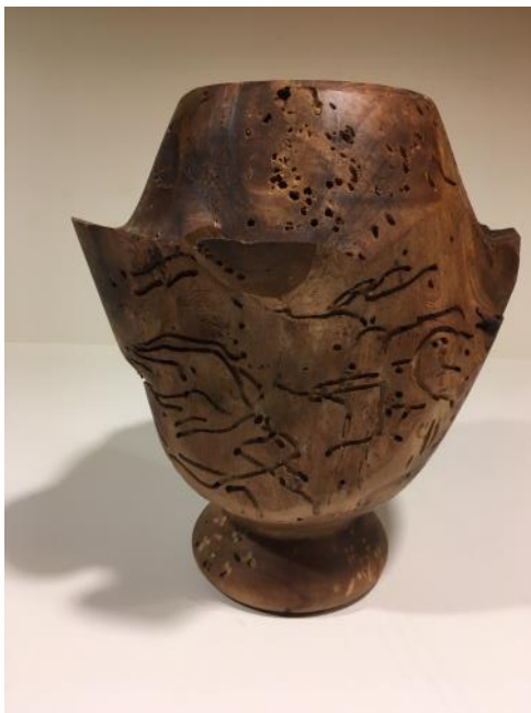
JOHN SOWELL Spalted Cherry 8" x 7"