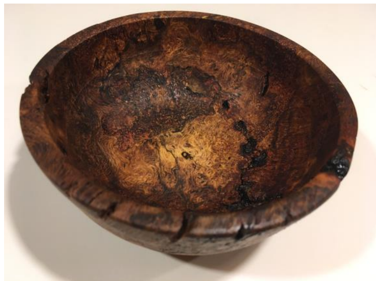
JOHN SOWELL Red oak Burl 3" x 5"