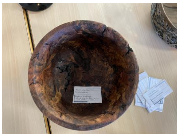
JOHN SOWELL View 1