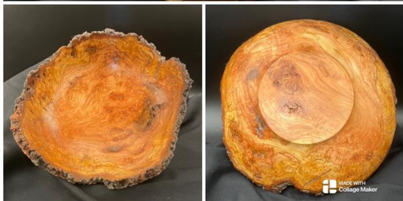
SUSAN MCMILLAN Cherry Burl