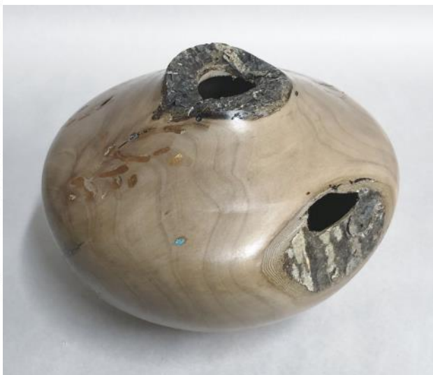
HOWARD KING Natural edge hollow form made out of Apple