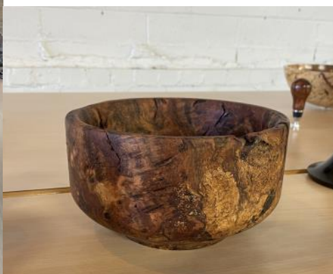
JOHN SOWELL View 2