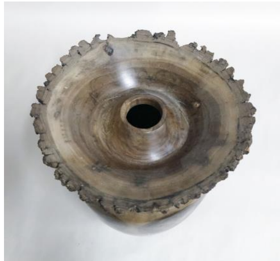
HOWARD KING TOP VIEW