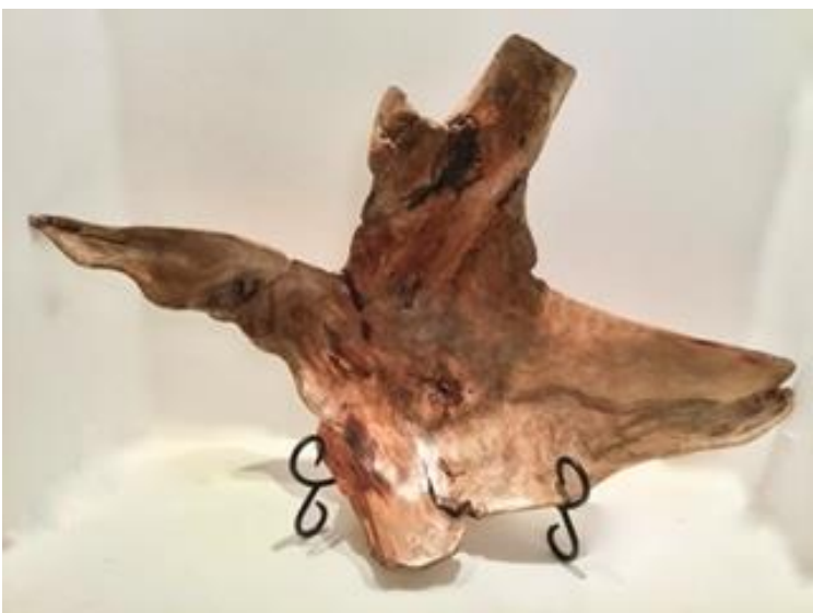
MAURICE CLABAUGH TEXAS MAP