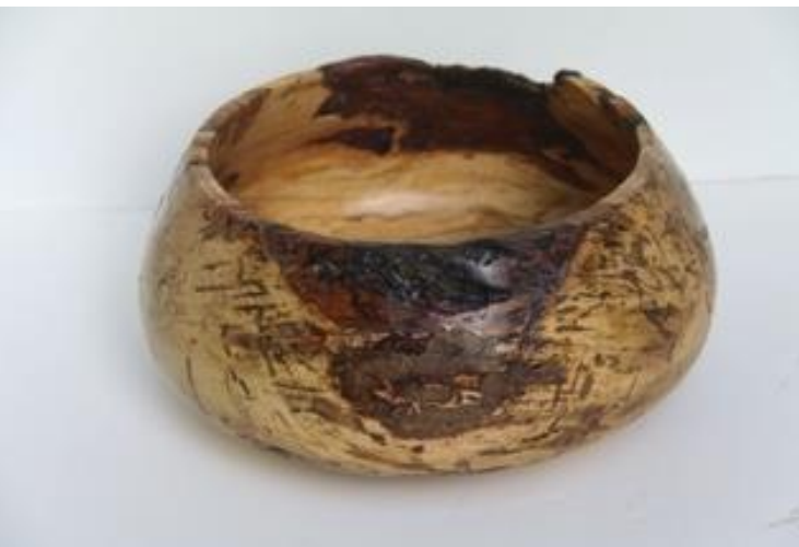
MAURICE CLABAUGH BARK INCLUSION