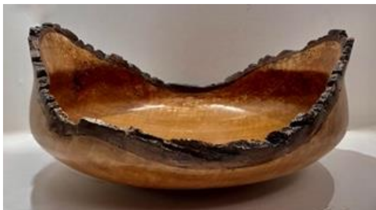
MAURICE CLABAUGH HIGH SIDES