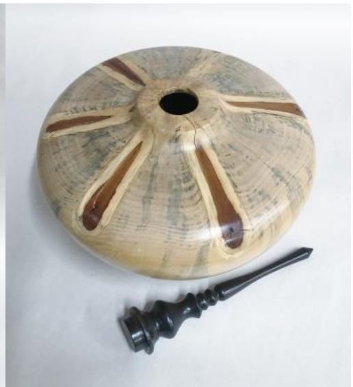
HOWARD KING VIEW 2