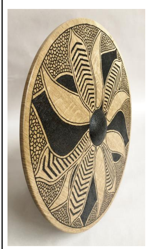
HOWARD KING The "platter" or "wall hanger" is titled "Pyro Opus 24" and is made of White Oak. 3rd view of photos from page 7