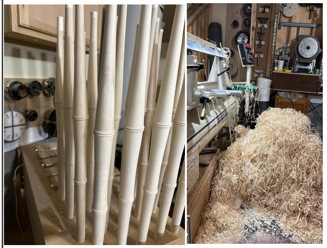
JEFF WYATT Preparing for the 4-legged stool class I'm teaching at highland woodworking in Atlanta.