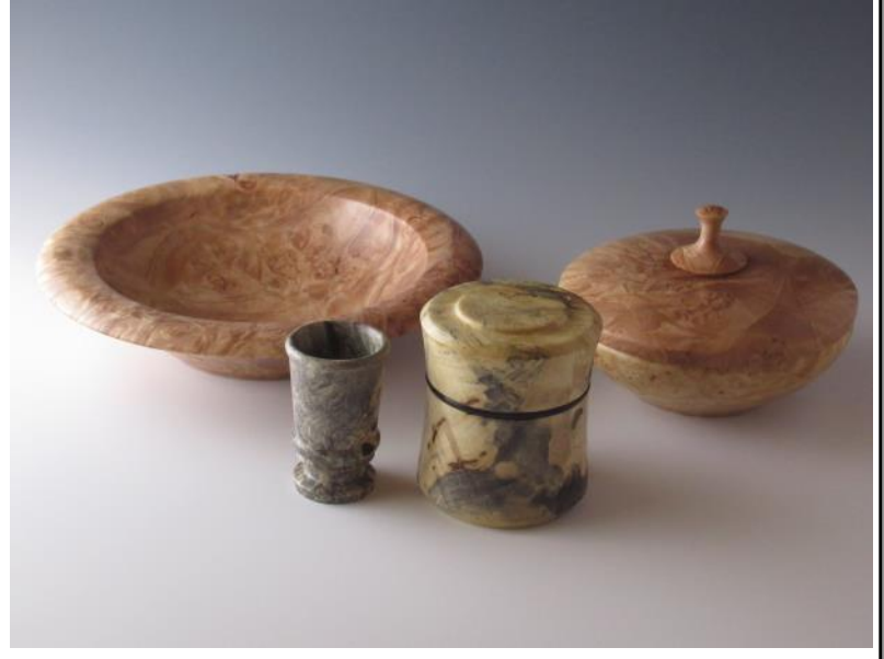
CARL CUMMINS BUCKEYE BURL & MAPLE BURL