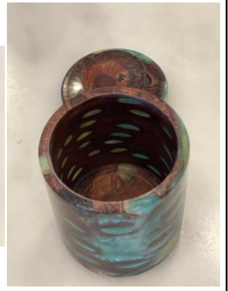
RANEY TYNER BANKSIA BOX 3 VIEWS