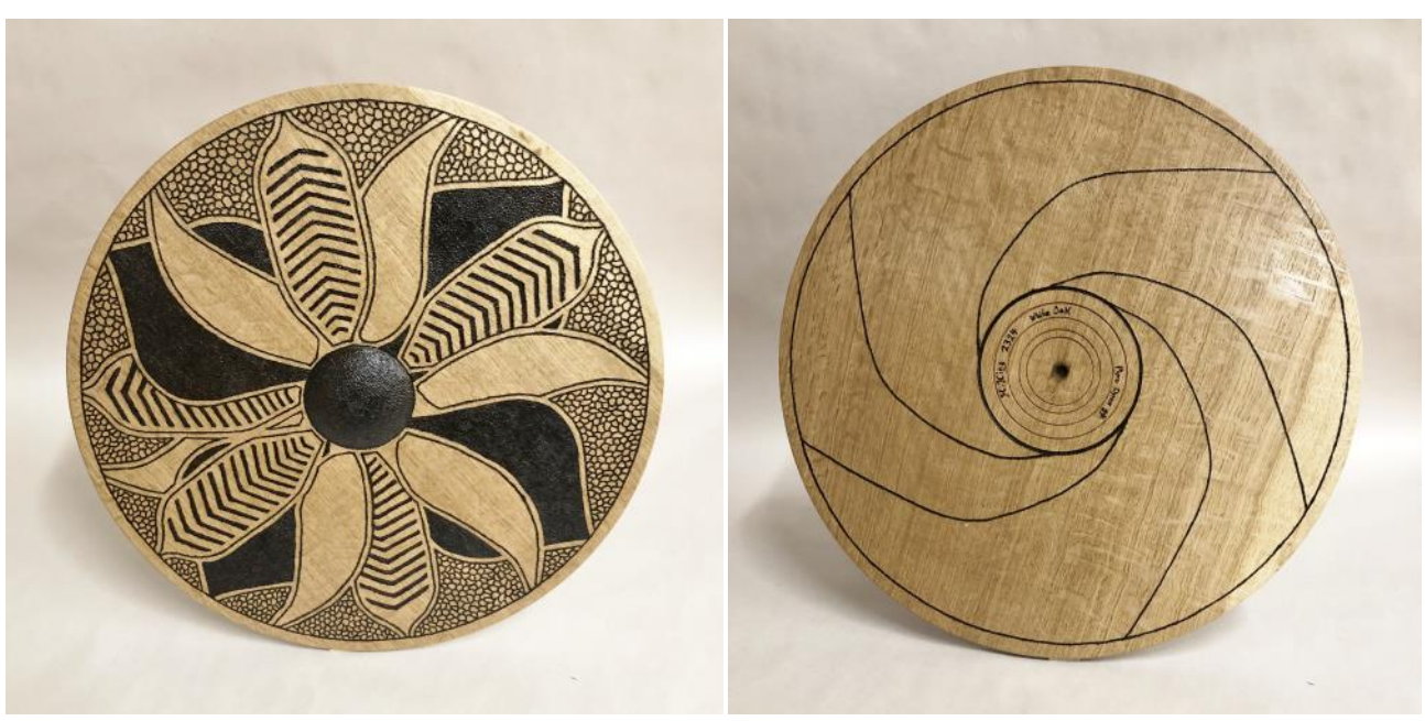
HOWARD KING The "platter" or "wall hanger" is titled "Pyro Opus 24" and is made of White Oak