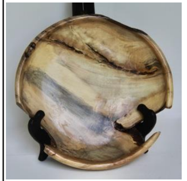
MAURICE CLABAUGH INCLUSION and HOLE