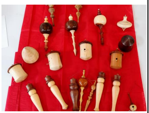
ORNAMENTS FOR THE TREE AT CHILDREN'S

We will be meeting at Hardware Park on Friday at 2:00 to set up for Saturday's meeting. Thank you all who come and help us set up!