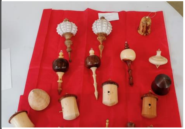
ORNAMENTS FOR THE TREE AT CHILDREN'S