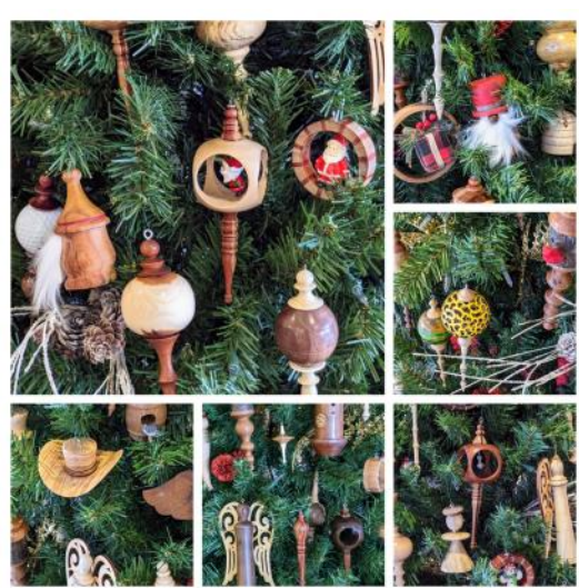
Sections of tree collage