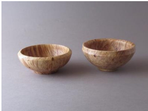
CARL CUMMINS Maple Burl