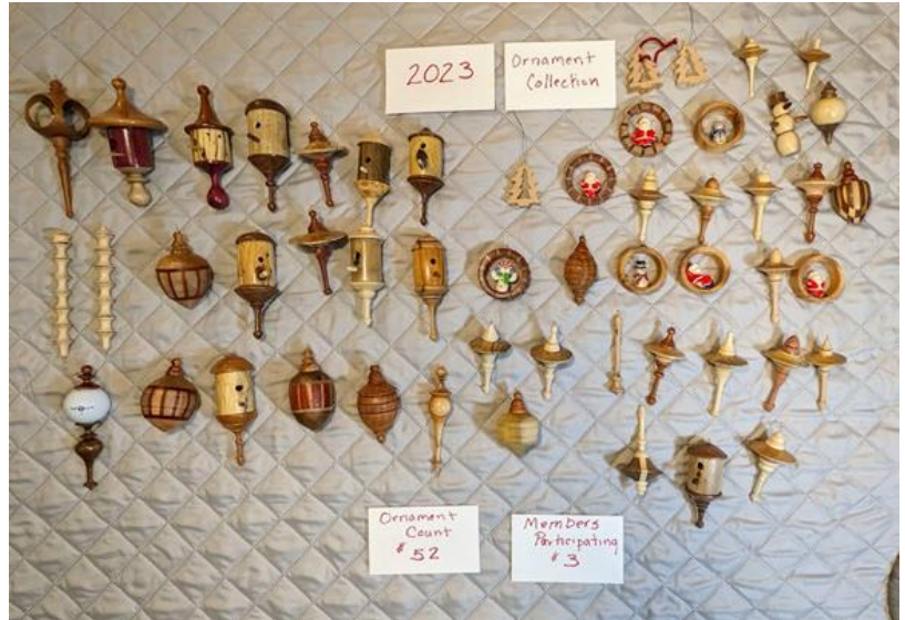
Ornaments submitted since February 2023.