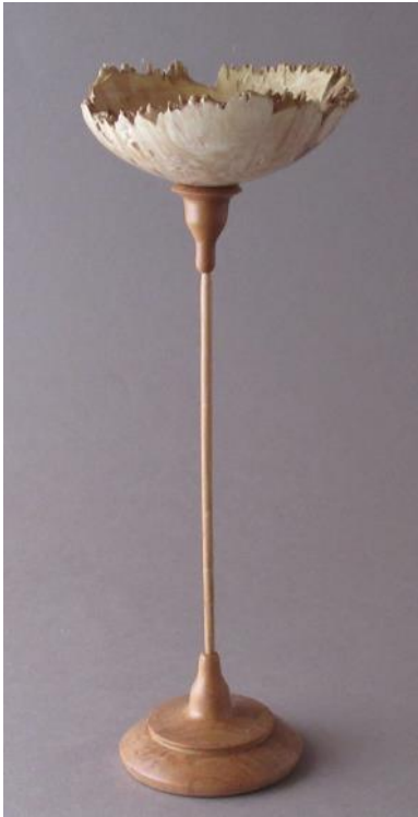
CARL CUMMINS Maple Burl & Cherry