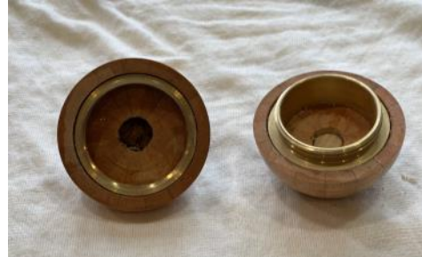
RANDY TYNER Segmented Ornament with brass threads 3 Views