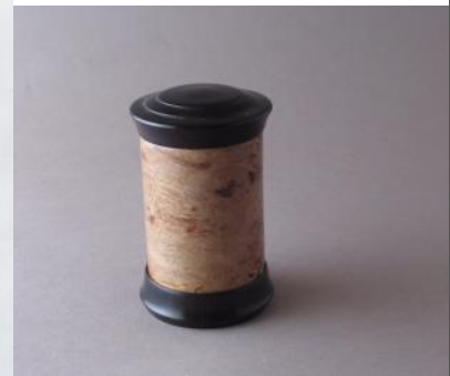
CARL CUMMINS Burl and Blackwood