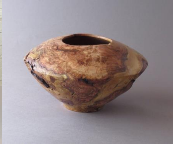
CARL CUMMINS Cherry Burl