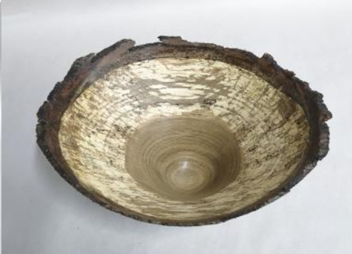
HOWARD KING 2 Views of White Oak Natural Edge Bowl