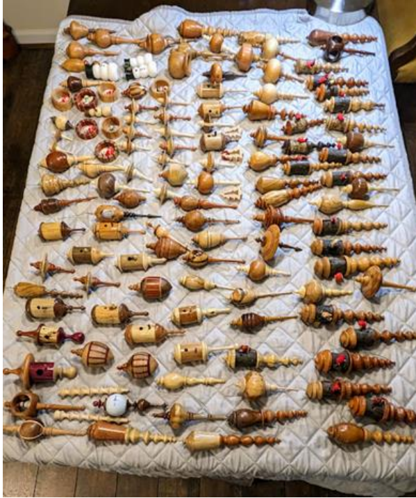
Ornaments submitted in 2023 plus left-over from 2022.