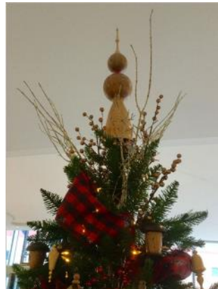
2018 TREE TOPPER JUSTIN MILLER