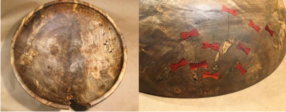
JOHN SOWELL Maple crotch bowl 6 x 20 With 26 Padauk bow ties for crack stabilization