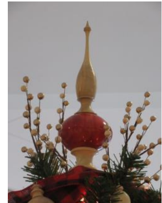
2022 TREE TOPPER CARL CUMMINS