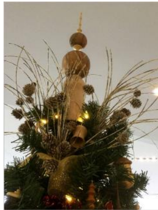
2017 TREE TOPPER JUSTIN MILLER