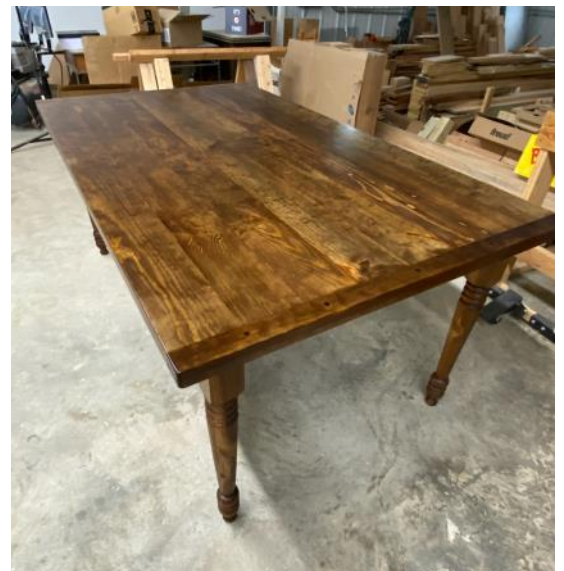
DWIGHT HOSTETTER Pine Country kitchen table with turned legs