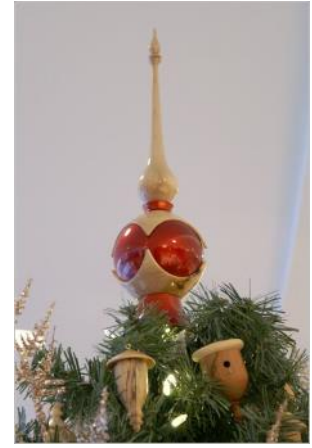
2015 TREE TOPPER TOMMY HARTLINE