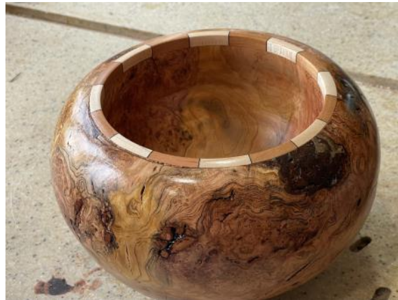
RANDY TYNER Cherry burl with segmented ring