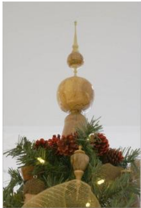
2016 TREE TOPPER JUSTIN MILLER