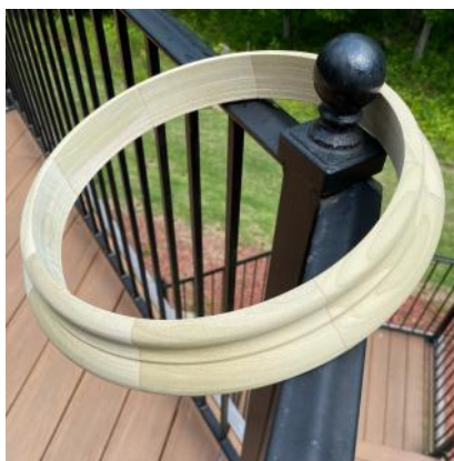
DWIGHT HOSTETTER Molding for porch columns turned on the lathe.