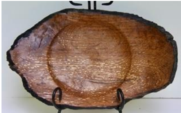
MAURICE CLABAUGH Shallow Plate, Bog Wood 15" w x 2.25" h