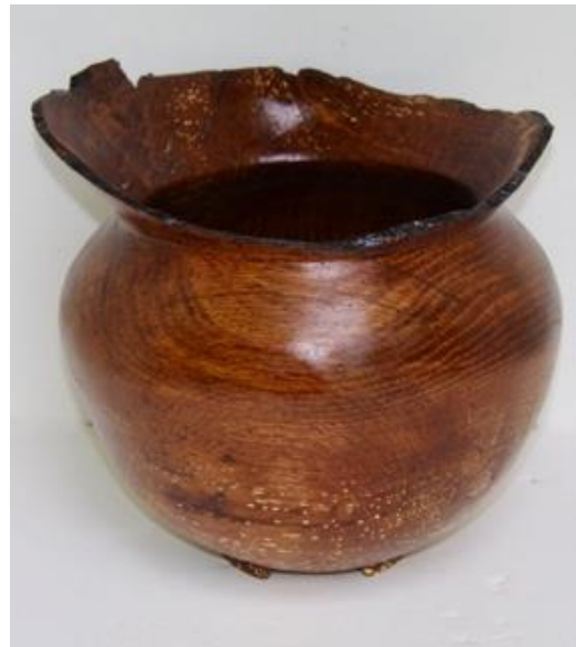
MAURICE CLABAUGH High Sided Basket, Bog Wood 9" w x 8.25" h