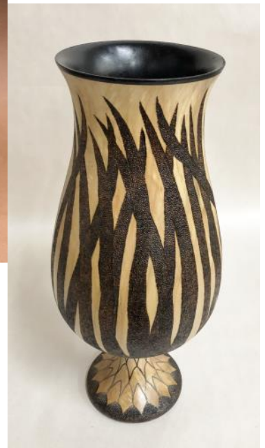
HOWARD KING Tall Vase made of Maple It is titled "Pyro Opus # 8".