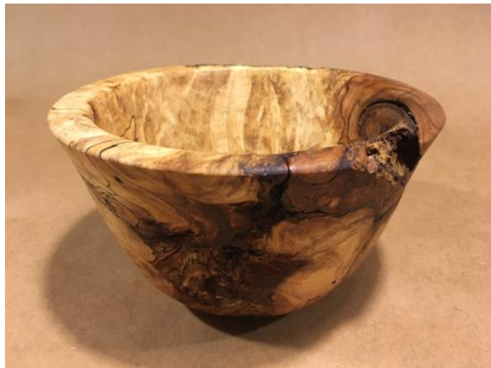
JOHN SOWELL Maple 4 x 7