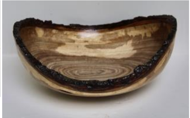
MAURICE CLABAUGH Hickory Rings, Hickory. 12" w x 5.25" h