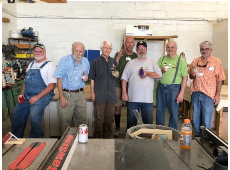
AFTERNOON CLASS — GONK