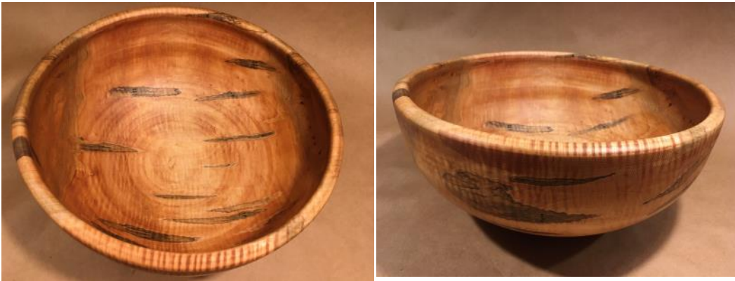
JOHN SOWELL Curley ambrosia maple 7 x 16