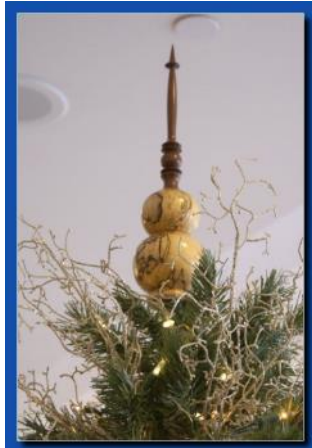
2012 TREE TOPPER TOMMY HARTLINE