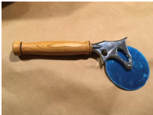
JOHN SOWELL pizza cutter with Cherry handle