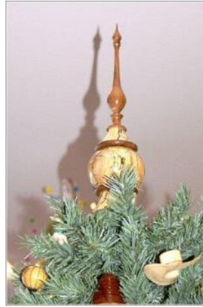
2013 TREE TOPPER TOMMY HARTLINE