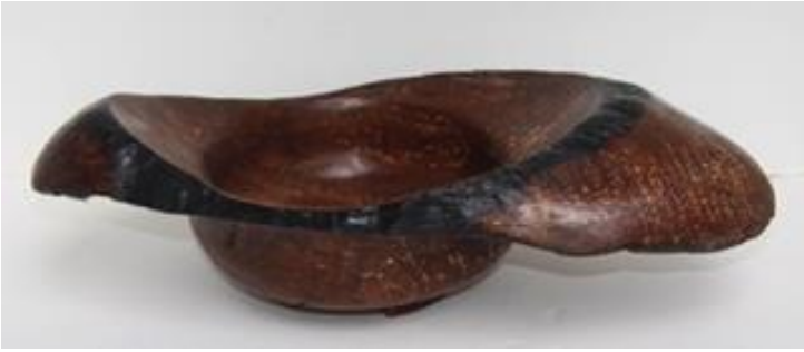
MAURICE CLABAUGH Off Set Bowl, Bog Wood. 14" w x 5" h