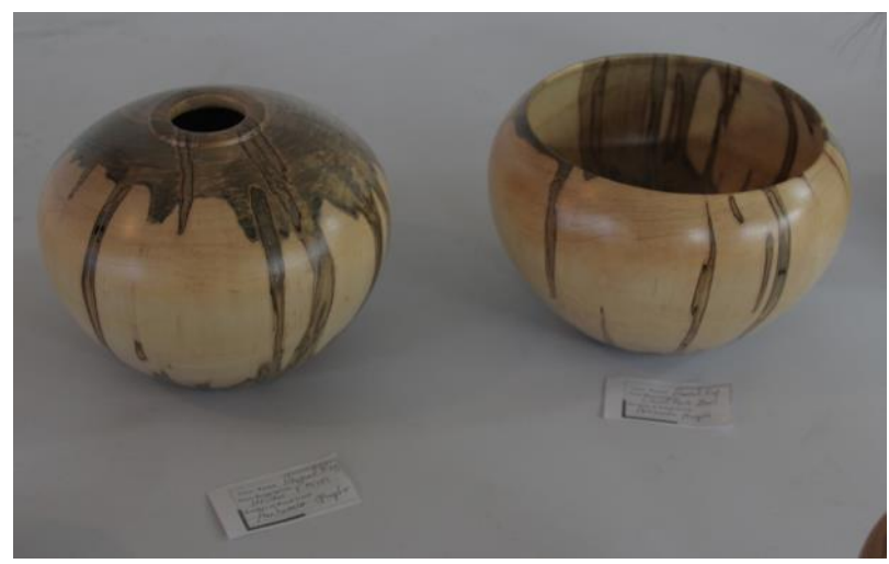
HOWARD KING Ambrosia Maple Hollow Form