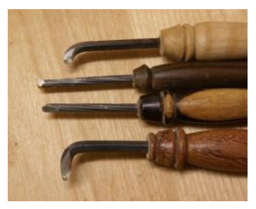
Mini Hollowing Tools Made with Allen Wrenches