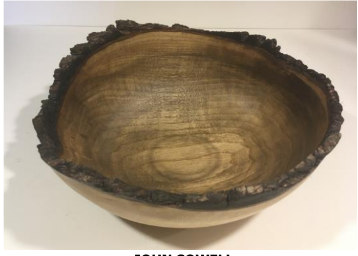
JOHN SOWELL Nothofagus (southern beech)