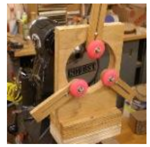
Steady Rest or Center Steady For turning larger pieces

Besides jigs, we are going to discuss things that you might need help with. Bring a project that has you stumped, or you need direction with. If you have a piece of wood that you want to turn into something nice, but you're not sure quiet where to begin, bring it, and let's get the wisdom of the group to assist you. Maybe you have a question about turning between centers, or questions about what finish to apply to a piece. We would like the folks who attend on-line to participate as well. Of course, the more participation, the more successful this meeting will be.