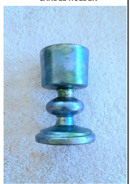
TIM TINGLE CANDLE HOLDER

Terry Tingles granddaughter at the lathe. Below is the pen she completed. Nice job!