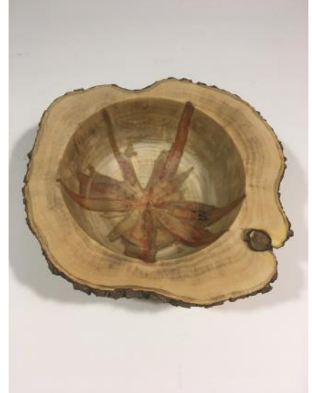
JOHN SOWELL Box Elder