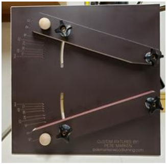
Wedgie-less Sled for cutting segments