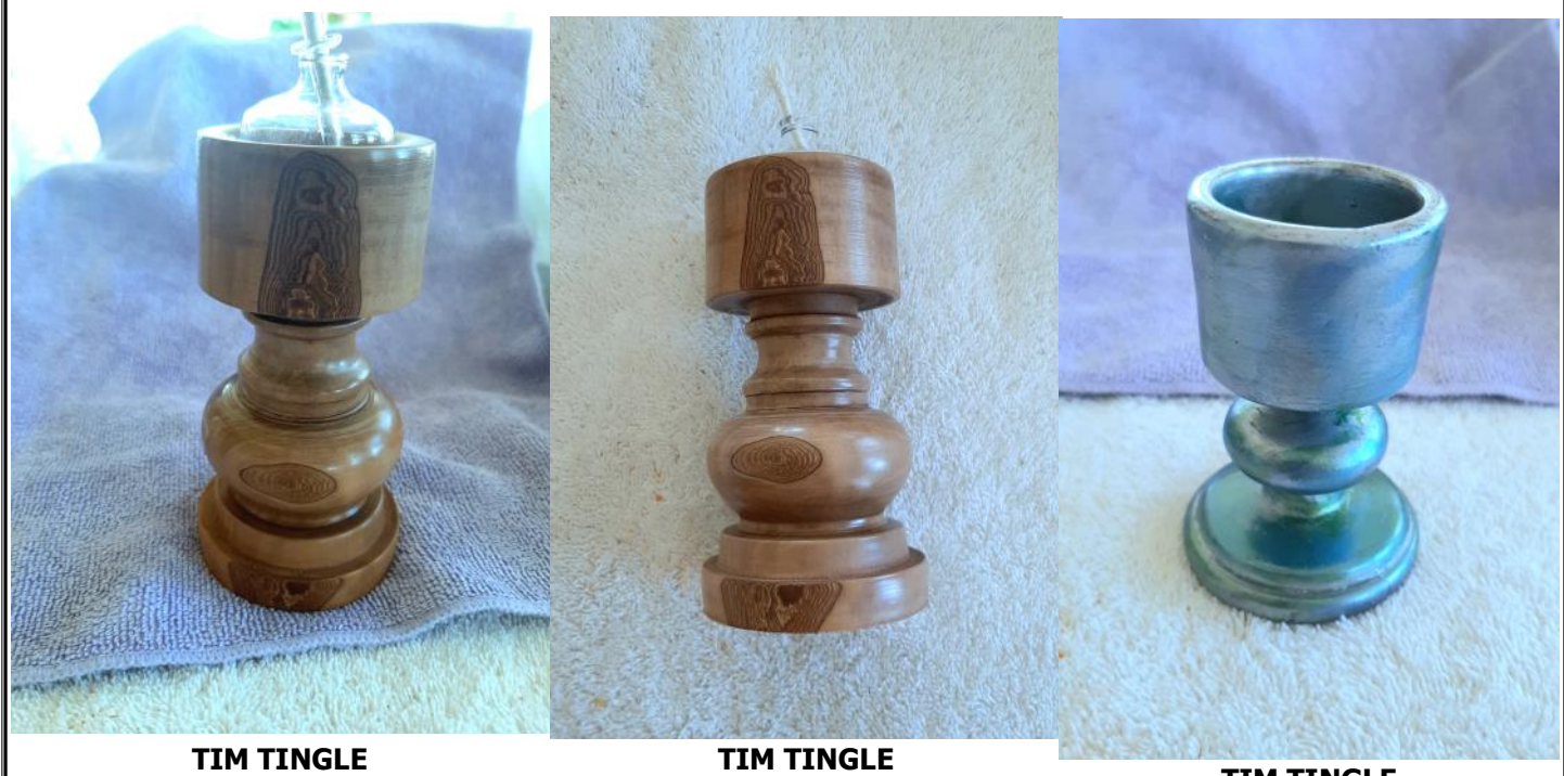
TIM TINGLE CANDLE HOLDER