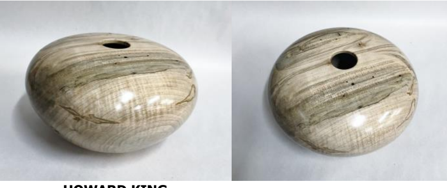
HOWARD KING VIEW 1