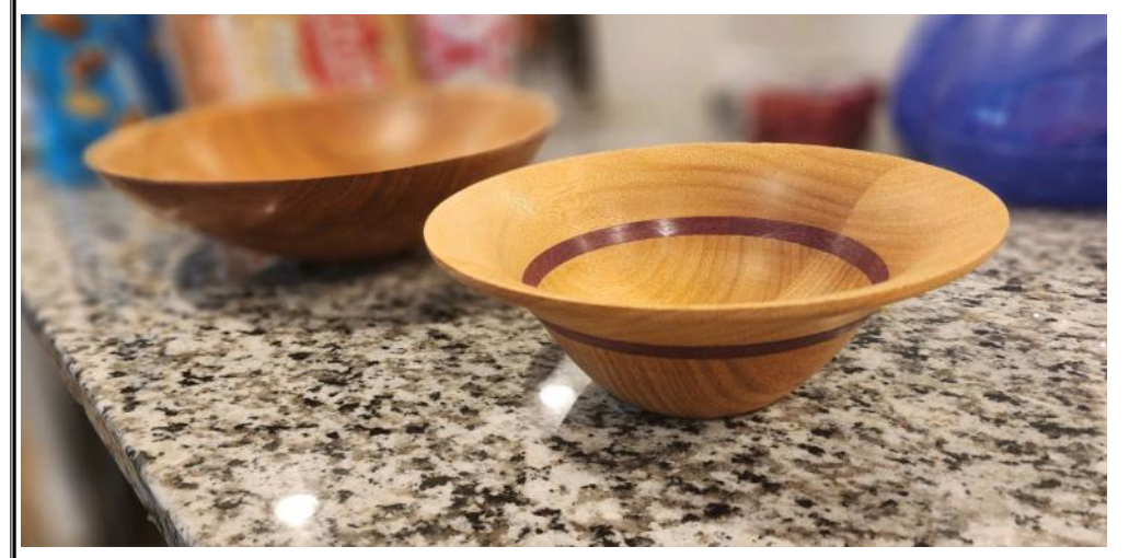
CHRIS HENLEY - Lati with a Purple Heart ring