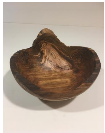
JOHN SOWELL Unknown Wood