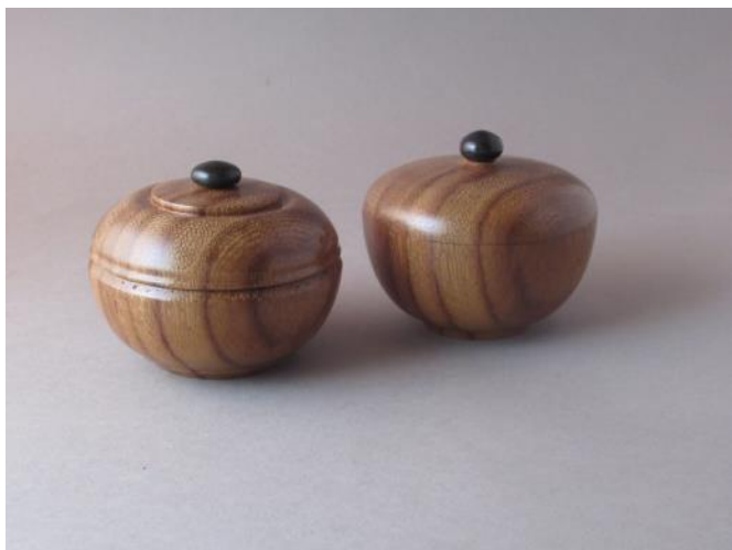
CARL CUMMINS Two lidded bowls, Guanacaste