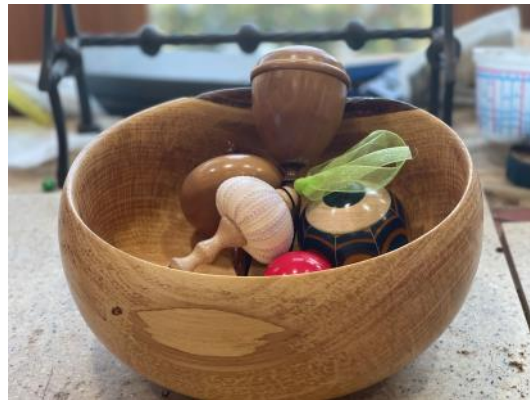
RANDY TINER 3 VIEWS OF THE SAME BOWL