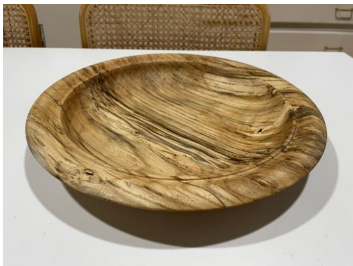
CARL CUMMINS Platter 14" x 2"