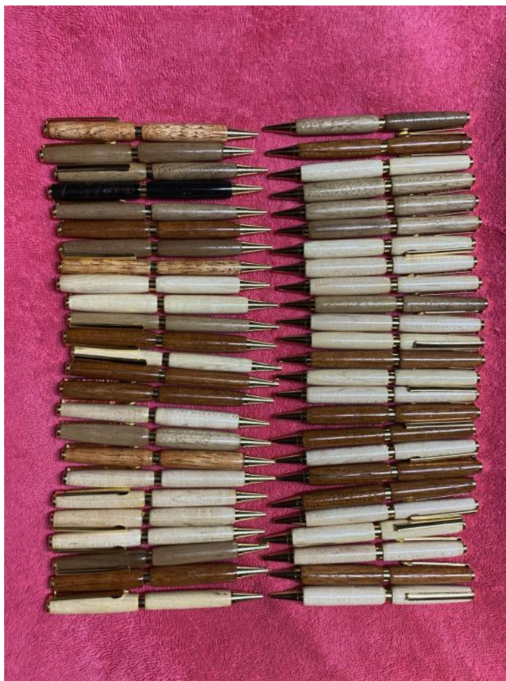
LEE BEADLES 50 pens I turned for the Woodcraft pen for the Troops program