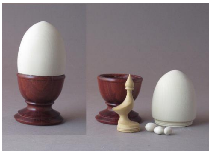
CARL CUMMINS Double surprise egg box