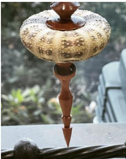
RANDY TYNER Captured ring sea urchin ornament