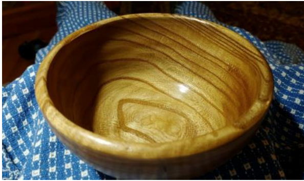
TERRY TINGLE CATALPA - VIEW 3