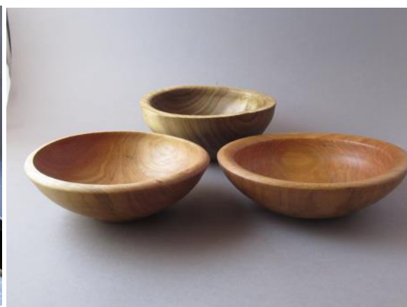
CARL CUMMINS RMM Demo bowls: cherry, catalpa