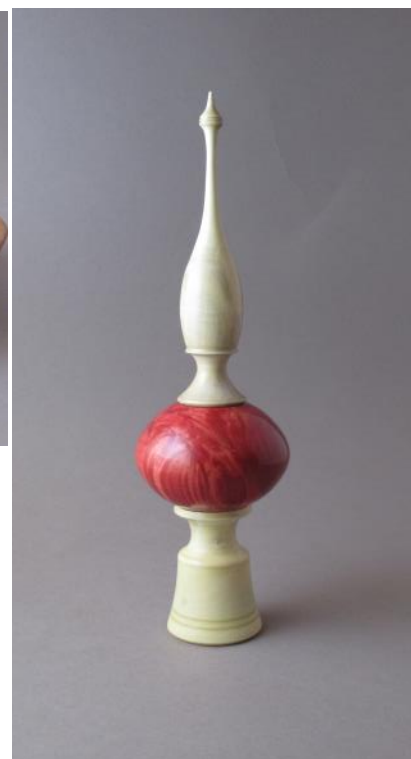
CARL CUMMINS Tree Topper: dyed maple burl, holly, CA finish