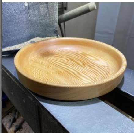
CARL CUMMINS Ernie Conover style tray, pine