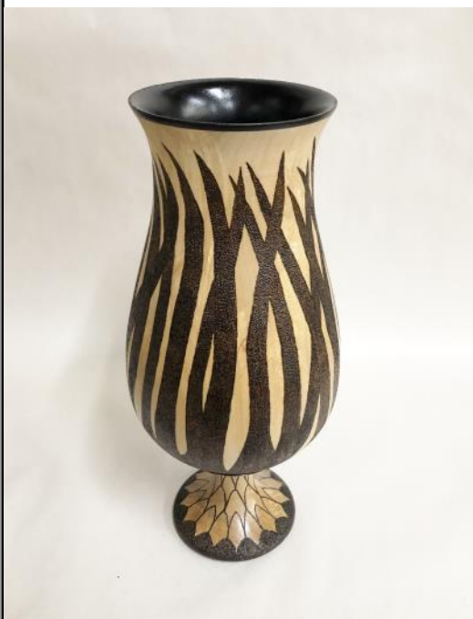
HOWARD KING -VIEW 1