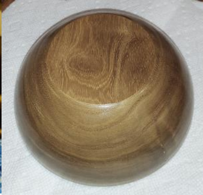
TERRY TINGLE CATALPA - VIEW 2