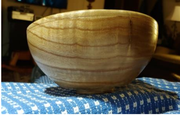
TERRY TINGLE CATALPA - VIEW 1