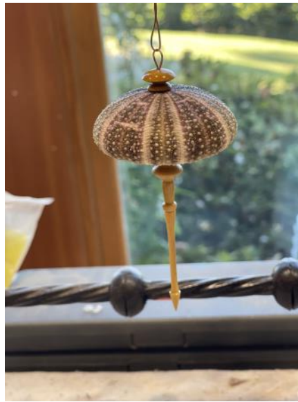
RANDY TYNER Sea urchin ornament