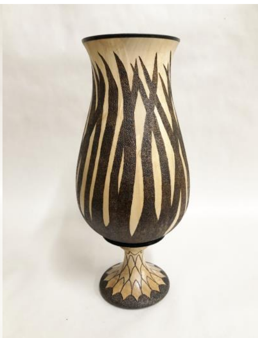
HOWARD KING -VIEW 2