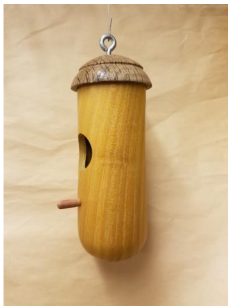
BRENT CLAYTON HUMMINGBIRD HOUSE/ORNAMENT