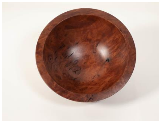
JOHN KILLIAN AU salmon gum, burl bowl