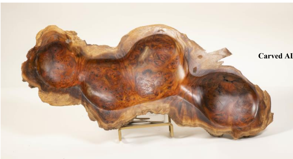
JOHN KILLIAN Carved AL cherry burl keys and change tray