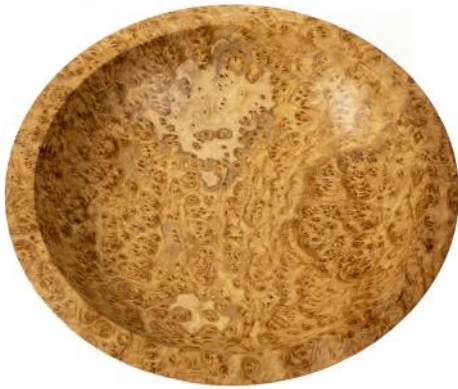
JOHN KILLIAN AU blonde/brown mallee burl platter