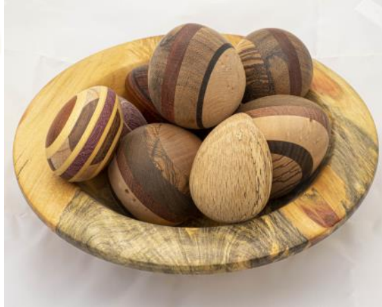
JOHN KILLIAN Egg glue ups in spalted box elder bowl