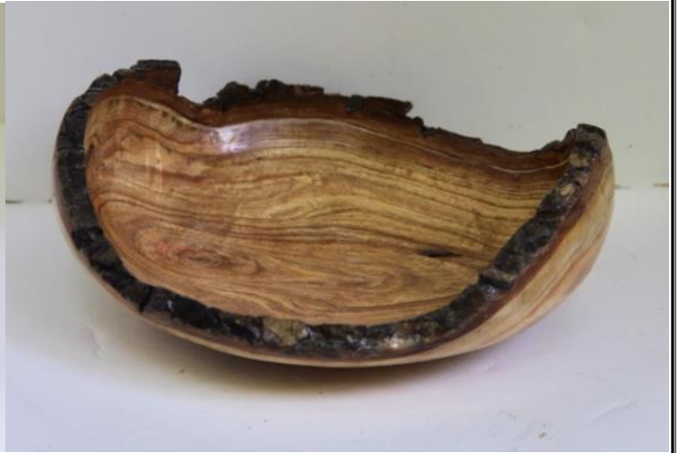
MAURICE CLABAUGH 14" Pecan Fork