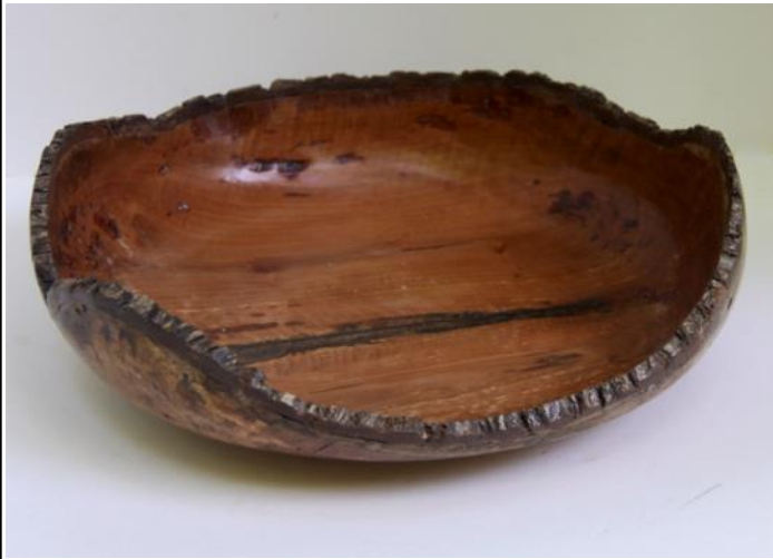
MAURICE CLABAUGH 16" Apple Fork with bark inclusion