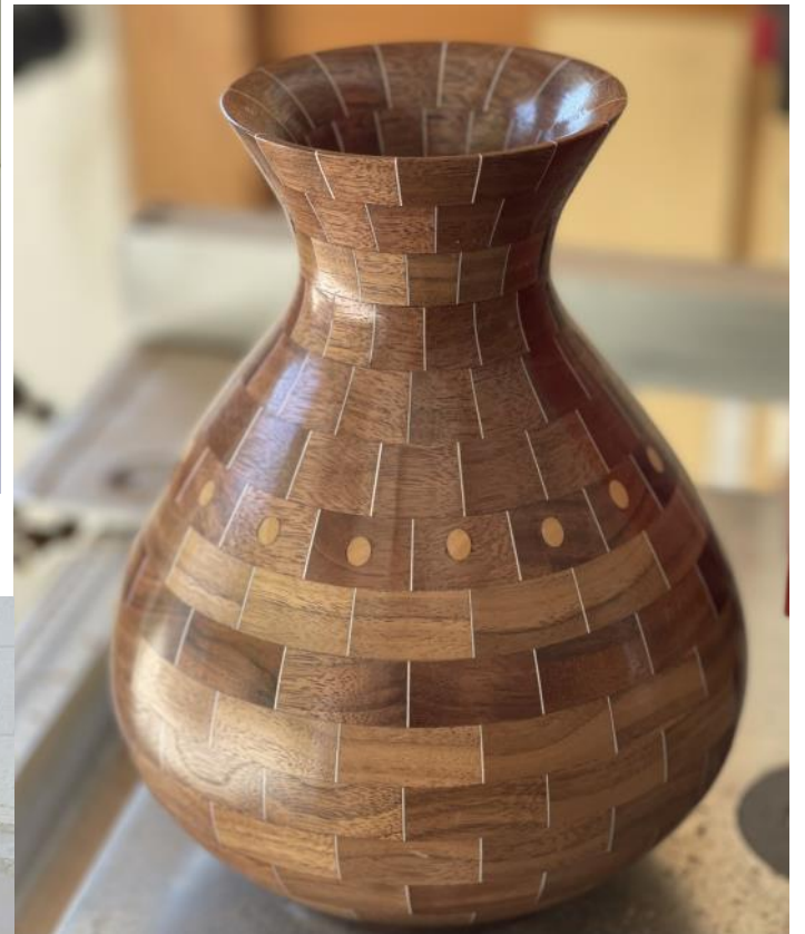
RANDY TYNER Segmented Walnut Vase