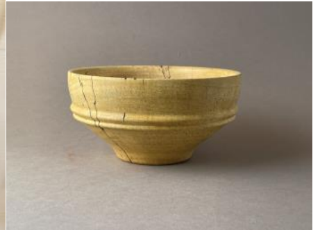
CARL CUMMINS TAMARIND