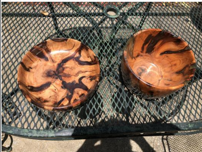
RON HERBSTER Epoxy resin bowls