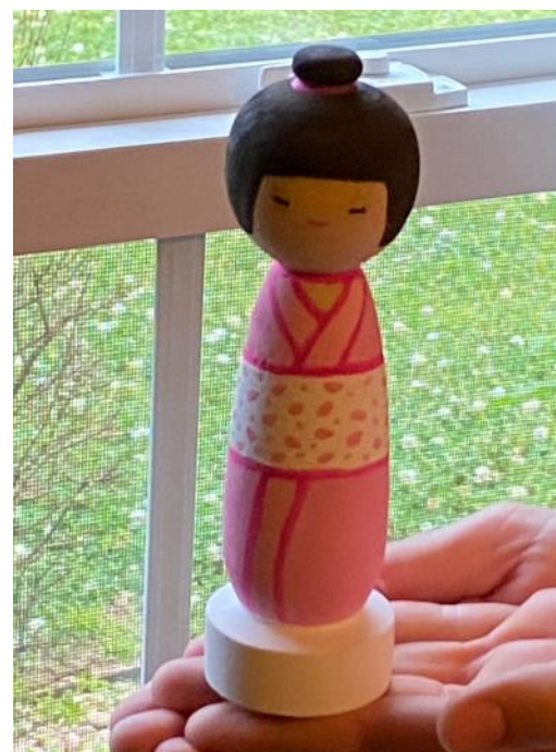
STAN KEENUM Kokeeshi doll painted by granddaughter