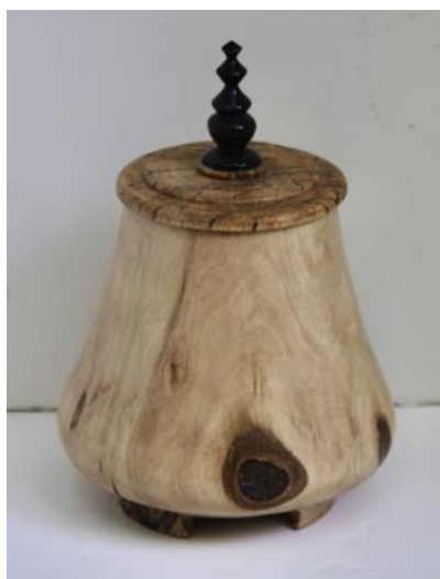
MAURICE CLABAUGH Lidded box- Crape Myrtle/ Spalted White Oak/ Ebony