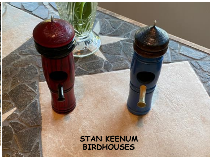
STAN KEENUM BIRDHOUSES