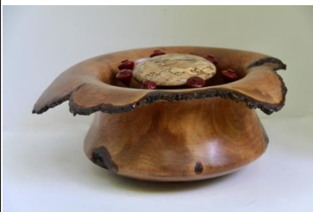
MAURICE CLABAUGH Pear Blossom Stable- Bradford Pear/ Spalted White Oak/ Padauk/Verdigris Copper