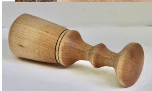
MAURICE CLABAUGH Baby Rattle- Maple with Walnut Oil Finish