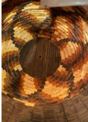
JEFF WYATT Working on a little segmented bowl