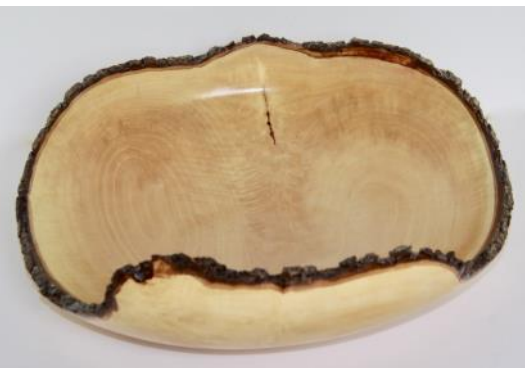
MAURICE CLABAUGH Bark and Feather- 15.5" w x 4" h