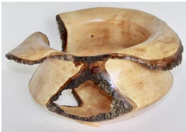
MAURICE CLABAUGH Bradford Pear II- 13.5 "w x 7.25" h