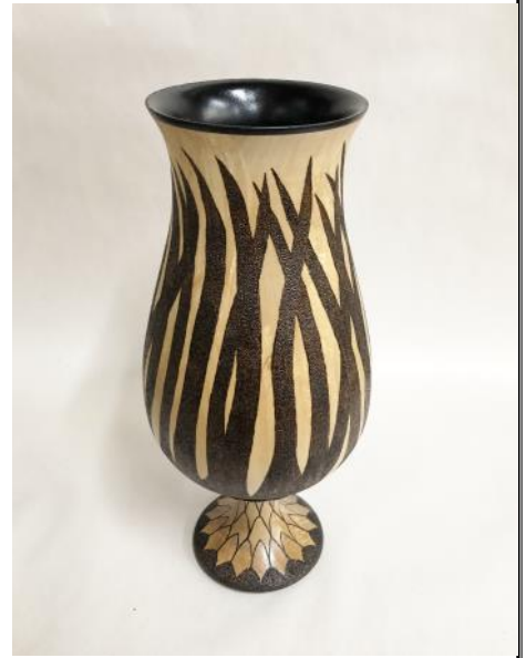
HOWARD KING PYRO 6