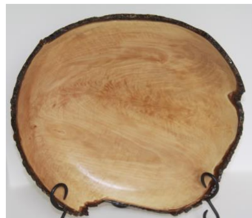
MAURICE CLABAUGH Big and Little Feather 15.5" w x 3.25" h