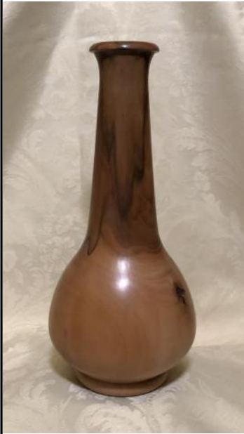
STEVE BURGESS 10.5' DOGWOOD VASE SATIN POLYURETHANE FINISH