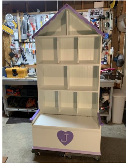
LYNN BASWELL TOY BOX