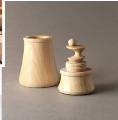
CARL CUMMINS SURPRISE BOX