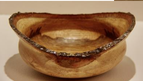
MAURICE CLABAUGH GIFT EXCHANGE