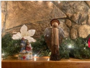
JIM HAVLIK - ANGEL