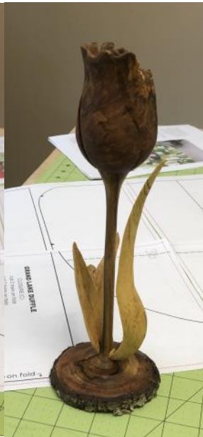
RON HERBSTER - B