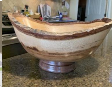
SUSAN McCALLA BILL-SUSAN BOWL VIEW 1