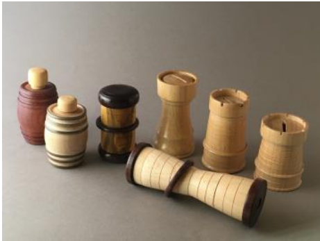
CARL CUMMINS - PUZZLE BOXES