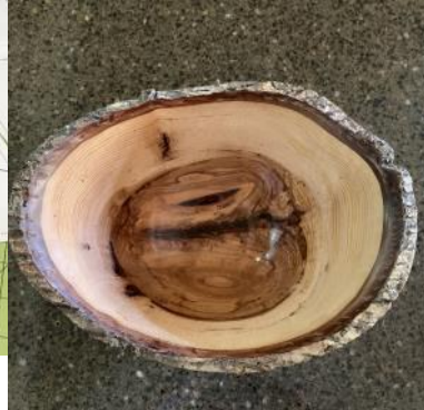
SUSAN McCALLA BILL-SUSAN BOWL VIEW 2