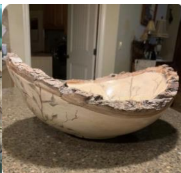
SUSAN McCALLA STEP 2 VIEW 2