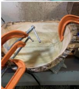
SUSAN McCALLA STEP 1