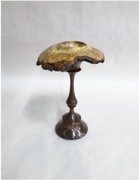
HOWARD KING PRESIDENTS CHALLENGE-JUNE RING OR EARRING HOLDER