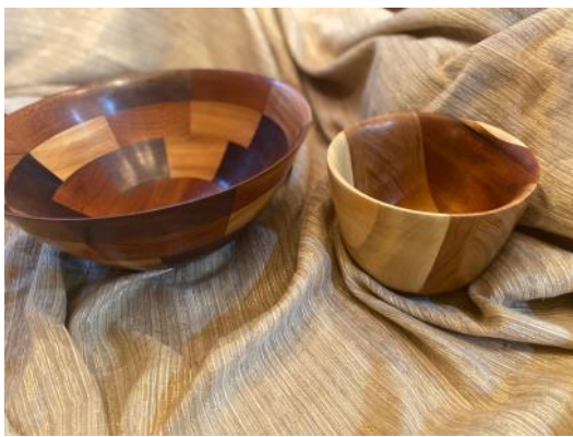
NOAH EDGIE — NEW TURNER!