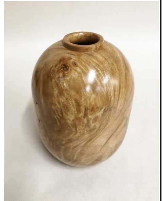
HOWARD KING MAPLE BURL