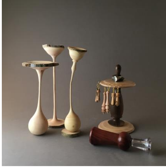
CARL CUMMINS PRESIDENTS CHALLENGE