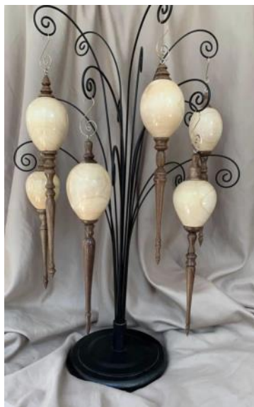
SUSAN MCCALLA SEE THE NOTE ABOUT THE WOOD

Family friends have done 4 international adoptions - 2 from China. When they returned from their first trip to China about 8 years ago, they came home to a newly planted Chinese Pistache. Fast forward, they're putting in a pool to assist both "China girls" with physical therapy as they're both in wheel chairs. The tree was in the way. They grieved the loss of their tree and then thought of me. Now they have special keepsakes from their special tree.