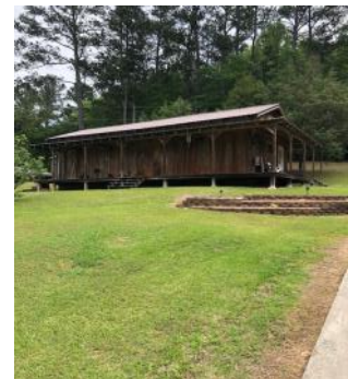
HOWARD KING'S SHOP