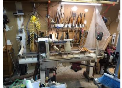
JOHN SOWELL'S SHOP