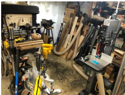
SCOTT ARNOLD'S SHOP