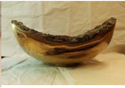
BRENT CLAYTON HICKORY 11" SIDE VIEW