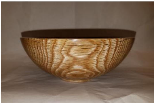
BRENT CLAYTON WHITE OAK 7" SIDE VIEW