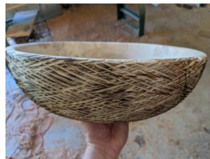
TERRY WHITE MAPLE 13X4 CHAINSAW & CHARRED