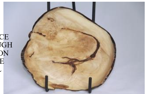
MAURICE CLABAUGH SCORPON MAPLE BURL