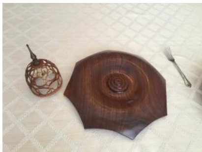
LYNN BASWELL (FORK FOR SCALE)