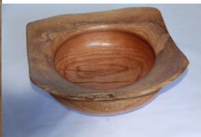
MAURICE CLABAUGH SQUARE - WILLOW OAK