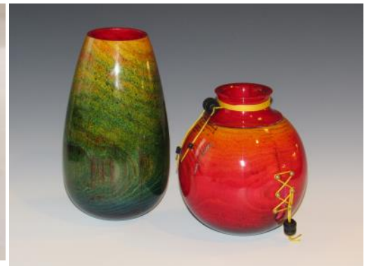
STATEN TATE EXPERIMENTING WITH COLOR & FINISH