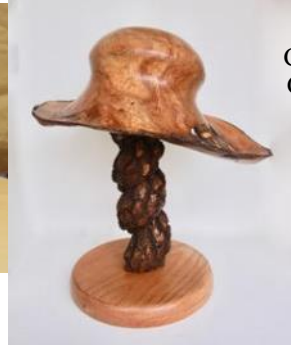
MAURICE CLABAUGH CHAPEAU - RED OAK BURL