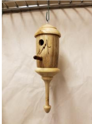
BRENT CLAYTON ORNAMENT 2