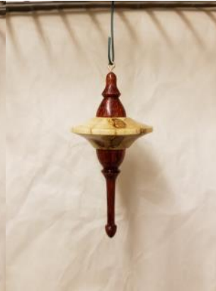
BRENT CLAYTON ORNAMENT 3