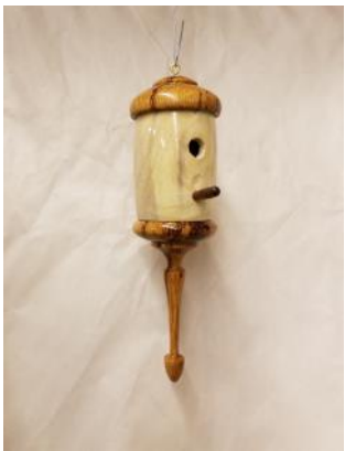
BRENT CLAYTON ORNAMENT 1