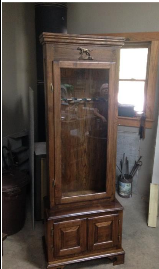
FORREST CARPENTER GUN CABINET OAK & BASSWOOD

Forrest provided this description of the gun cabinet with carving: