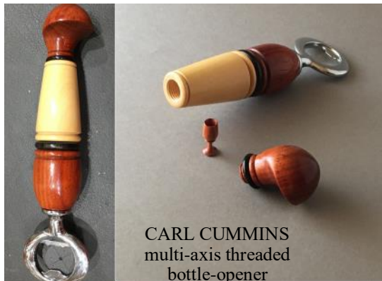
CARL CUMMINS multi-axis threaded bottle-opener