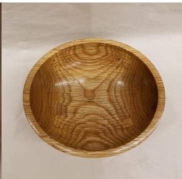
BRENT CLAYTON WHITE OAK 7"