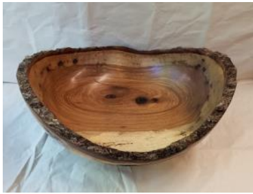
BRENT CLAYTON HICKORY 11"