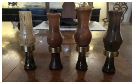
FORREST CARPENTER DUCK CALLS OAK, CHERRY, TEAL, WALNUT

Gun cabinet is made from Oak, dog is carved from Basswood stained with walnut oil stain and finished with Minwax Polyurethane and hand waxed."