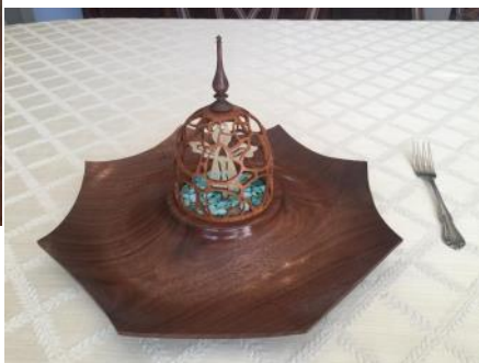
LYNN BASWELL (FORK FOR SCALE)