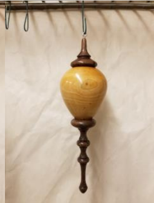
BRENT CLAYTON ORNAMENT 4