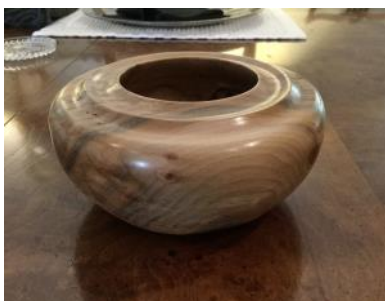
FORREST CARPENTER WILLOW