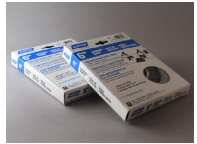
6" GRINDING WHEEL