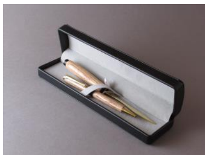
PEN & LETTER OPENER BUDDY FINCH