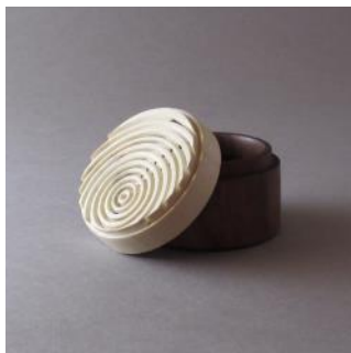
LATTICE TOPPED BOX CARL CUMMINS