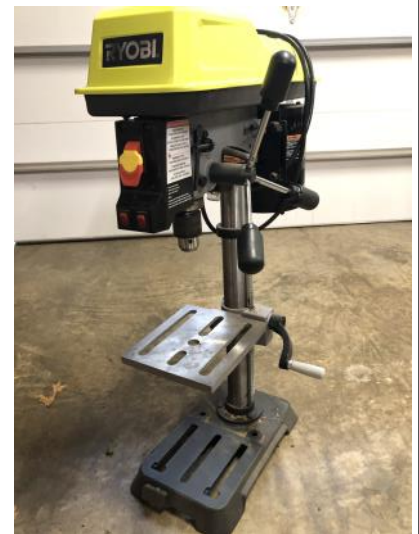
RYOBI DRILL PRESS