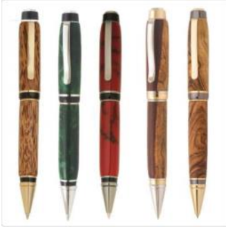
BIG BEN PIN KITS