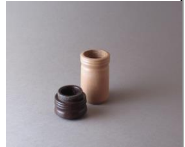
SMALL THREADED BOX CARL CUMMINS