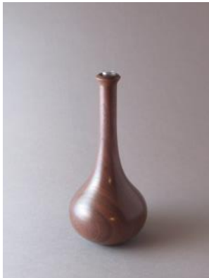
JACK CAPPS WALNUT VASE