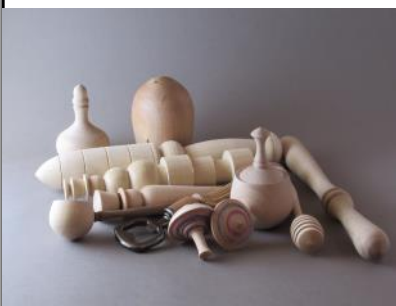
VARIOUS PIECES TURNED BY NICK COOK