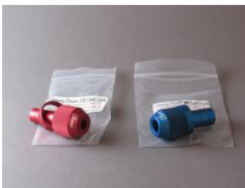
JIMMY CLEWES CAM LOCK