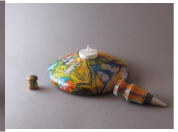
JACK CAPPS HYDRO DIPPED ITEMS