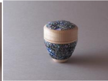
PEGGY SCHMID POLYMAR CLAY BOX