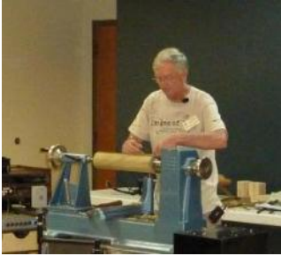
Start with round and brown