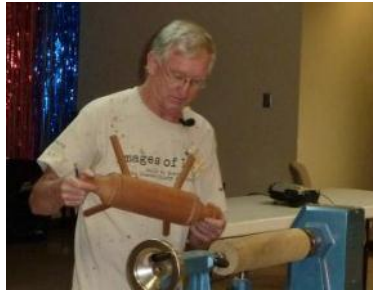
Make that look like this!