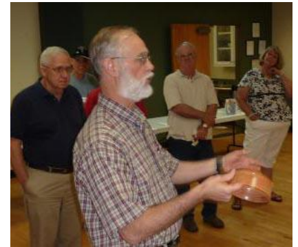
No name Tag