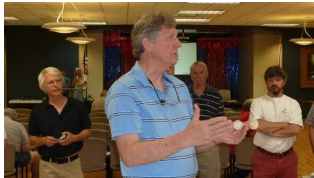
No name Tag