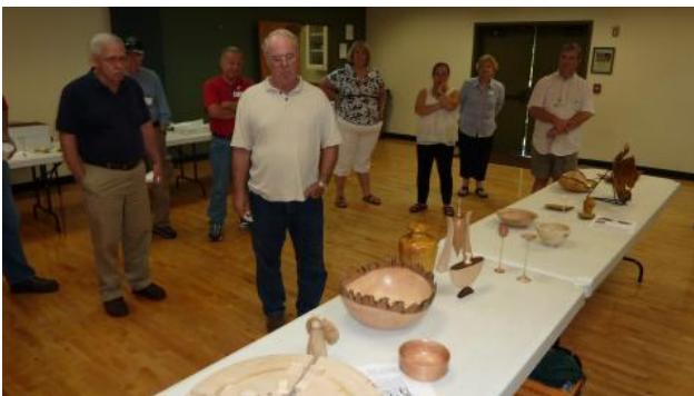
No name Tag