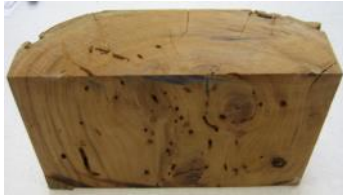
Is this American chestnut?