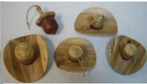
Hats Off to the Nut! Dwight Hostetter