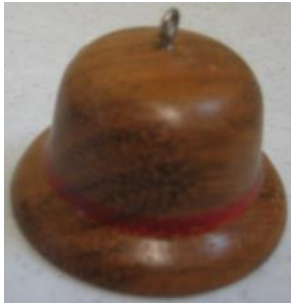
Maurice's Hat Trick! (Actually 4 of them!)