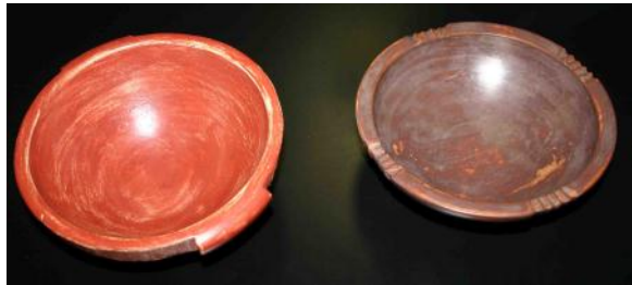
Milk paint finish