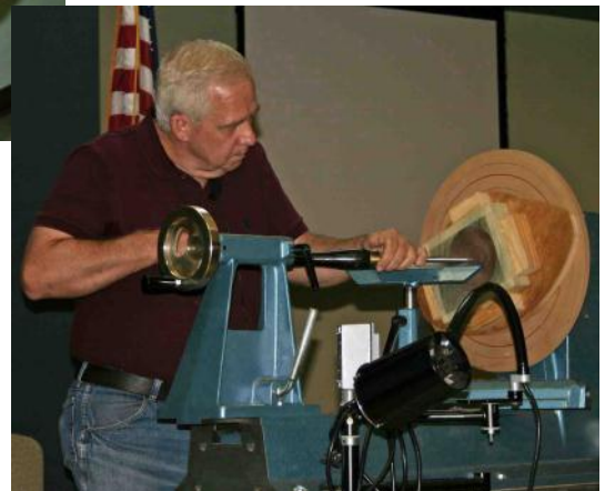
Finally, a bowl gouge!