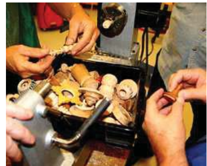
Fluting & Spiraling