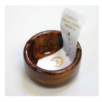
Editors Note: Sorry there are no

Sorry there are no names—I had to leave early and could not get the names.