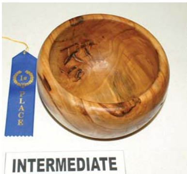
1 st place Intermediate Category Tom Corbett