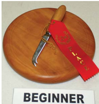
2 nd place Beginner Category Malcolm Fifer