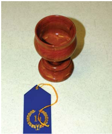
1 st place Beginner Category Jim Ogle

THE OCTOBER COMPETITION RESULTS – There were at least ten entries in last month's competition. Some from newer members and some from those getting back into turning after a lay off. We had some Christmas ornaments, bowls, a goblet, a platter, kitchen utensils, and some very small knitting needles which appear to have been very challenging to turn on a lathe. Some of those are shown below.