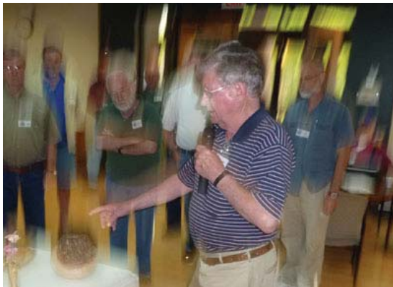
Mus ua been sumthin' in the coffee!