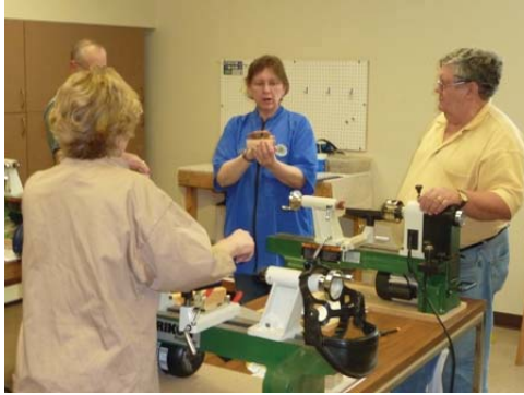
Pay attention class!