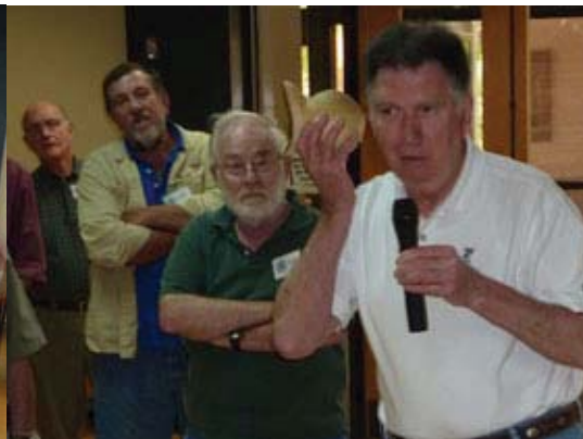
If you just listen to the wood...