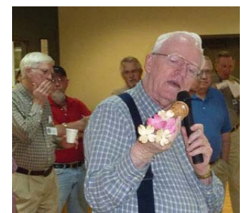
Why won't the salt come out?