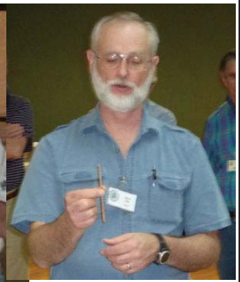
and I found this twig...