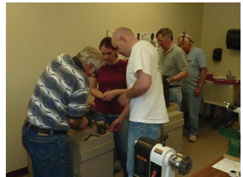
Help me get my thumb loose!