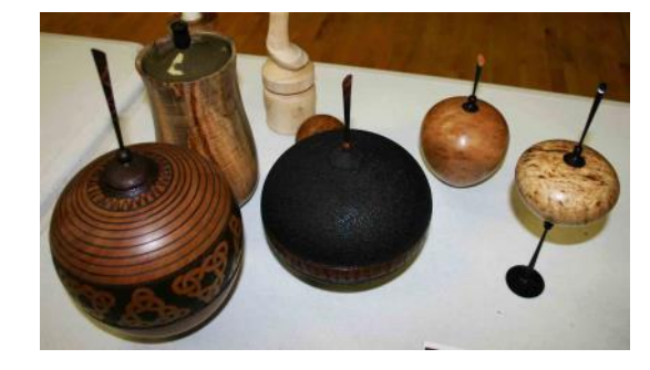
Some of Keith's Work