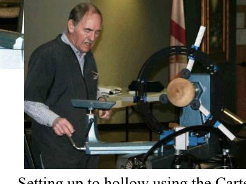
Setting up to hollow using the Carter Hollow Roller System and MultiRest.