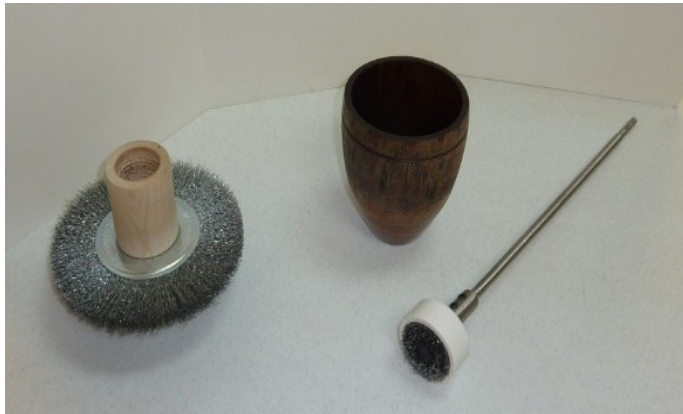
Will Pate — brushes & dark vessel