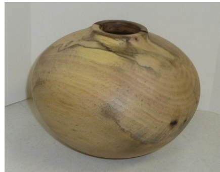
Shan McCurley — closed vessel