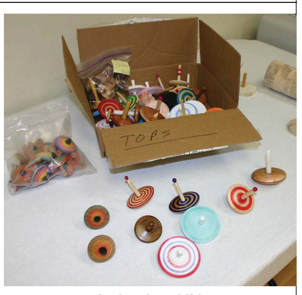
Tops for hurting children!