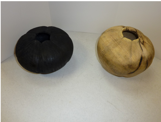
Sean McCurley — closed vessels, textured