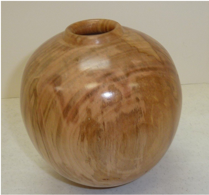
Tommy Hartline — Closed vessel