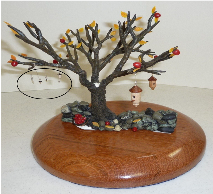
Jack Capps — Birdhouses. Be sure to look at the mini birdhouses in the circle.