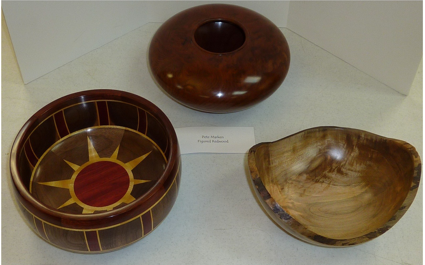
Peter Marken — 3 different types of turnings

Meeting schedule: Monthly meeting is the second Saturday of each month. Coffee and donuts at 8:30 am and the meeting starts at 9:00 am.