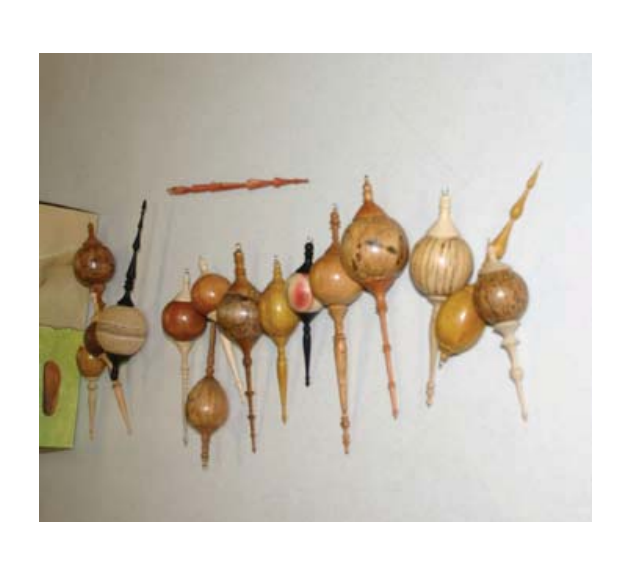
It's time for Christmas Ornaments! We have over 300 to make!