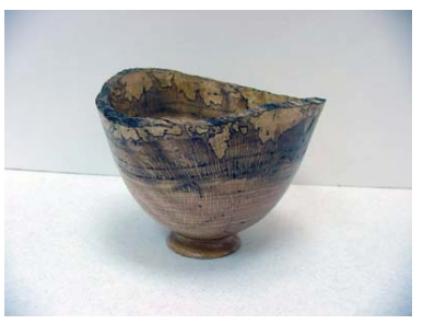
ENHANCED OR SEGMENTED