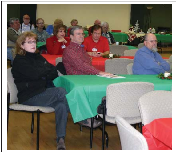
Rapt attention... or dozing...