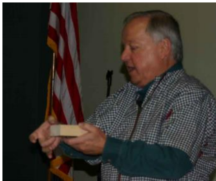
Start with a blank