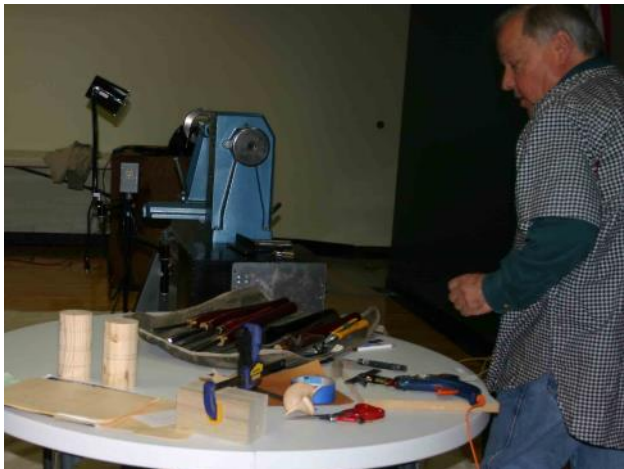
Lots of tools!