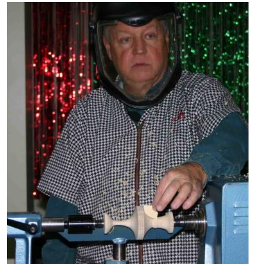
A gauge to get the shape right.