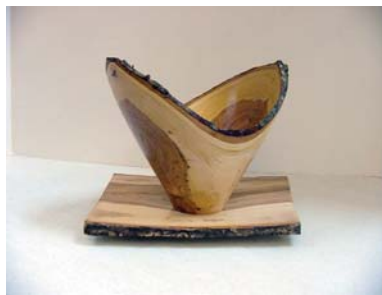
2 nd – Will Pate