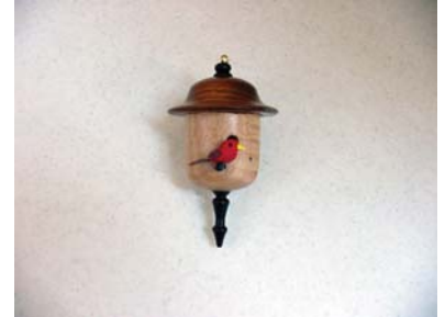
3 rd - Genereux