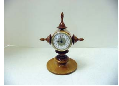
3 rd – Alan Stanton