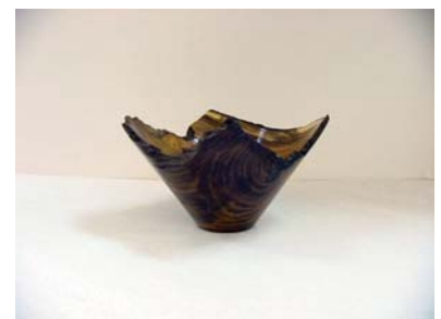
3 rd - Will Pate