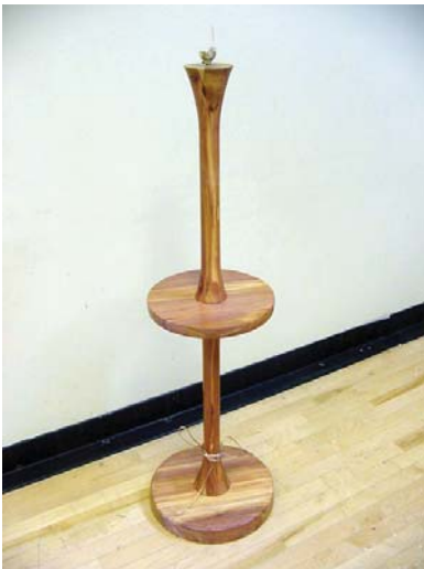
1 ST – Malcom Fifer