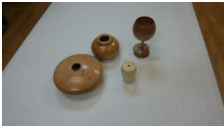
Jack Capps Carl Cummins Dwight Hostetter