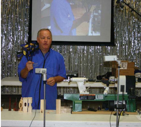
Where to get a deal on those clamps