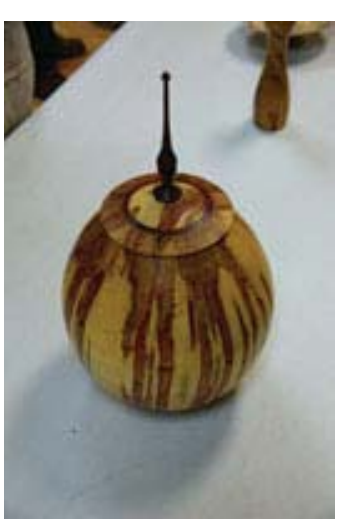
Box Elder Vessel