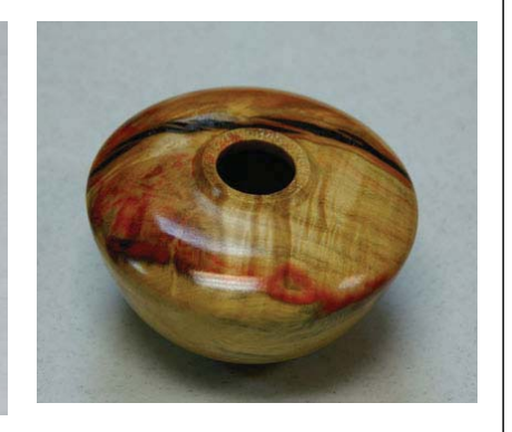
Something Box Elder