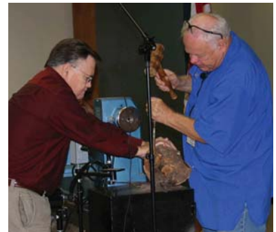
A little hand work.