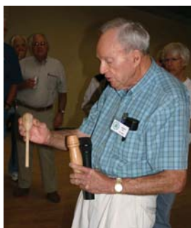
And FIRE comes out!