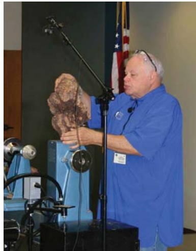
How I decide what to do...