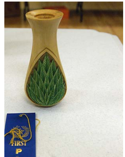
Staten Tate's turned, carved and dyed bud vase