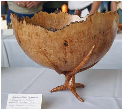
Alan Hollar's carved leg bowl