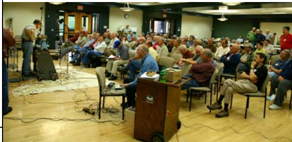
Good Turn Out