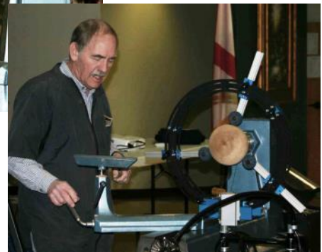
Setting up to hollow using the Carter Hollow Roller System and MultiRest.