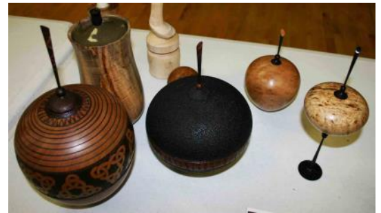
Some of Keith's Work