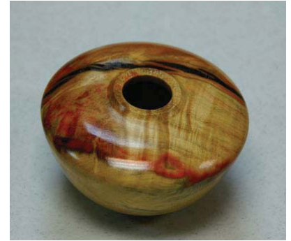
Something Box Elder