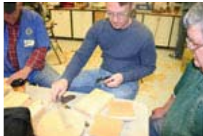
'Take the square Root...