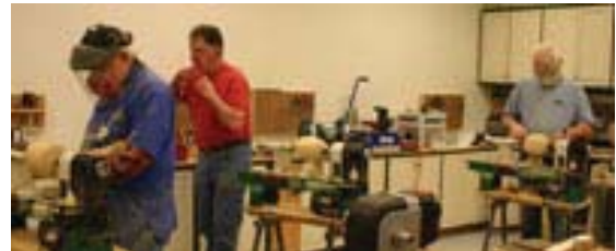
Woodcraft's Training Facility