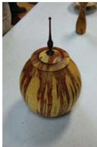
Box Elder Vessel