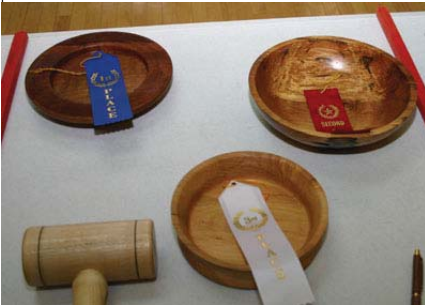
JT Ripple Sweep!