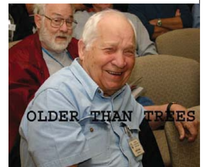
80 years old!